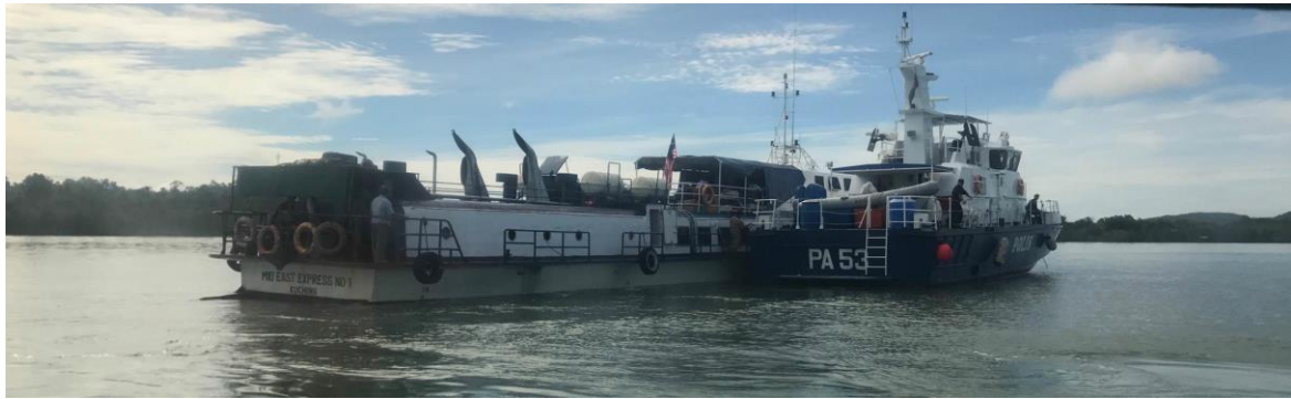
Figure 2: Malaysia’s Marine Police perform a regular inspection of passenger ferry Mid East Express as it approaches Tawau.