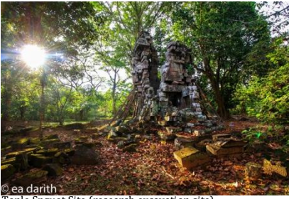
© ea darith Tonle Snguot Site (research excavation site)