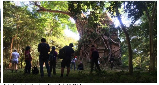
Site Visits to Sambor Prei Kuk (2016)

Applicants Sought: Applications are being sought from students and junior level professionals interested in pursuing a three week intensive Field School programme focused on culture, heritage and archaeology in Southeast Asia. The Field School will begin in Siem Reap, Cambodia and conclude in Singapore. Substantial travel and lodging subsidies will be provided to approximately 10-12 successful applicants.