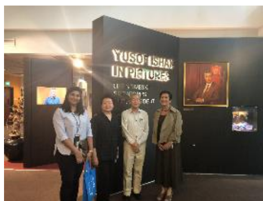
Librarians from SMU Libraries visited ISEAS Library on 18 Dec 2017.