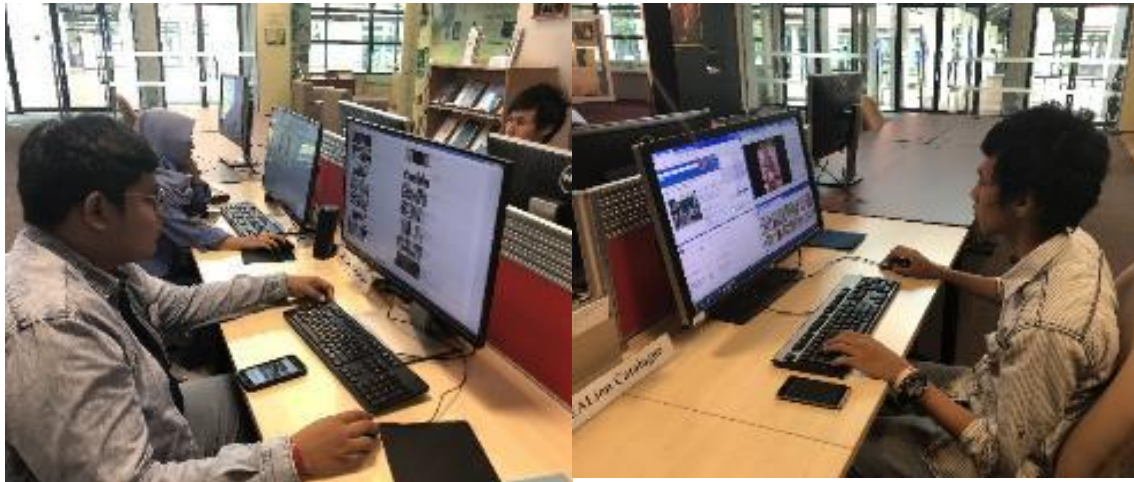
Students working on the Made Wijaya photograph collection through online database SealionPLUS.