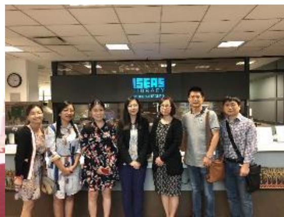
Delegates from National Library of China visited ISEAS Library on 12 Nov 2017.