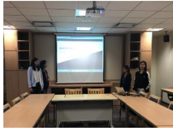
Highlights from RGS Programme 2017. (Top left) processing of private papers; (Top right) processing of digitised microfilm images; (Bottom left) collection stocktake using RFID device; (Bottom right) Group presentation sharing the work experience at ISEAS Library.