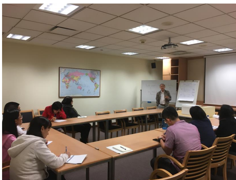
Head of Library conducting briefing on the processing of the private papers on 3 Jul 2017