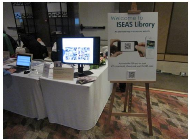
(Left) Library staff arranging book display at ROF 2017; (Right) Library booth at ROF 2017.

A total of 140 conference participants visited the booth, representing close to 25% of the total number of participants. 24 of them registered on the spot as new users members. About half came from public sector - government/statutory boards. 16 new users also subscribed to the Library's free Info-Alert services – Daily News Alert and Monthly Articles Alert.