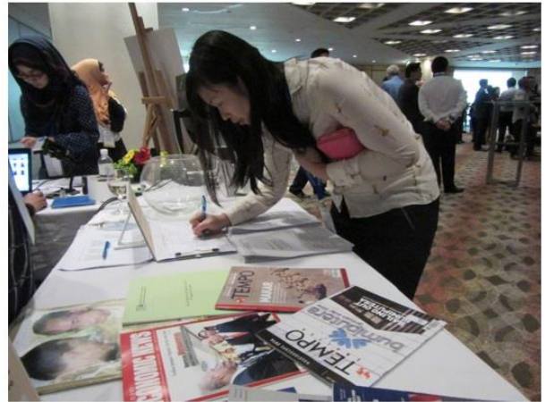
(Top left) Staff taking photo of new user for Library Membership Card; (Top right) Staff assisting user with filling in user registration form; (Bottom left) A new user looking at Info Alert print-out; (Bottom right) A new user filling in Info Alert subscription form.