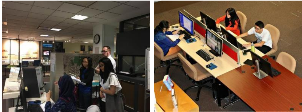
Highlights of WEP with NTU students. (Left) Students being briefed on the microfilm scanning; (Right) Students cataloguing and describing Toshio Egawa collection photographs and uploading to online database-SealionPLUS.