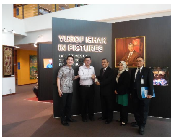
(Top left) Student visit from Centre for ASEAN Studies, Cambodia, 11 Apr 2017; (Top right) Visit by Central Bank of Malaysia, 20 Apr 2017; (Bottom left) Visitors attending book launch of “Yusof Ishak: A Man of Many Firsts”, 5 May 2017; (Bottom right) Delegation from Policy Analysis and Development Agency (BPPK), Indonesia, 13 Jun 2017.