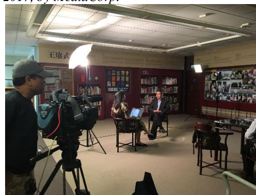
* Interview with Mr Salahuddin Ayub, Speaker of ISEAS' Seminar:AMANAHA: A Game-Changer in Malay-Muslim Politics on Jakarta Election at Wang Gungwu Corner, 9 May 2017.