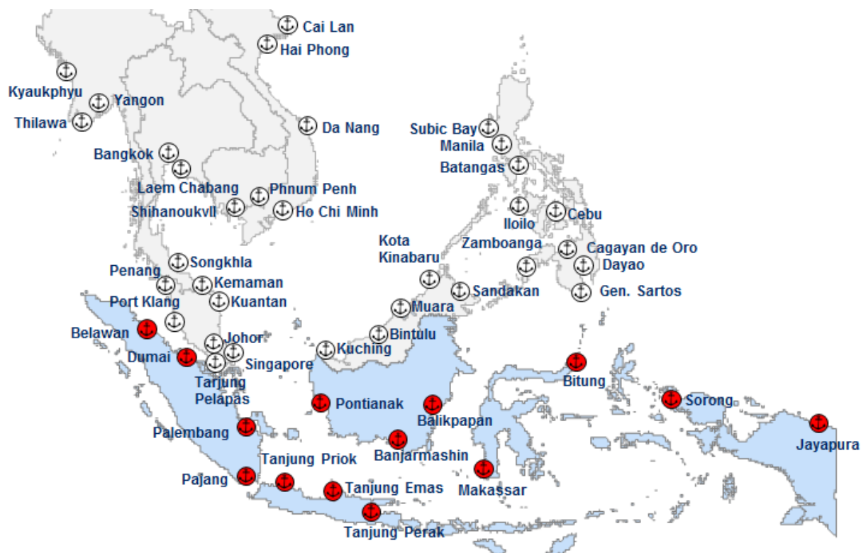
Figure 2: 47 Designated Ports in ASEAN, including 14 in Indonesia