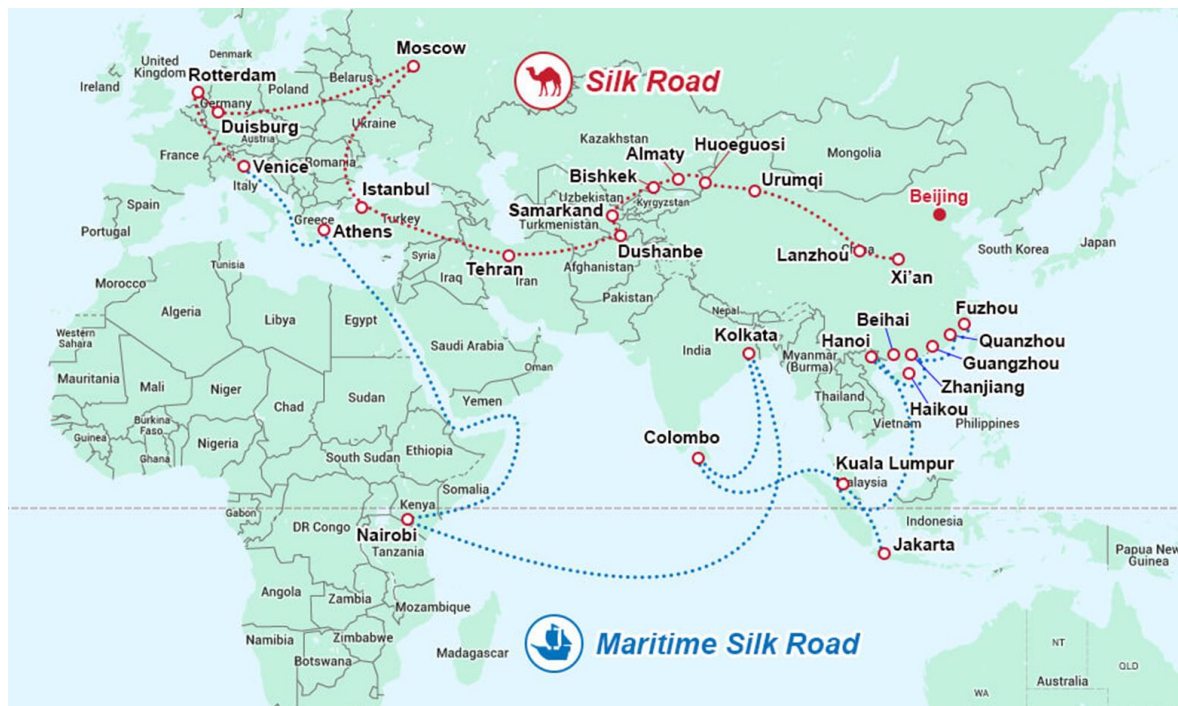
Figure 3: China's Belt and Road Initiative