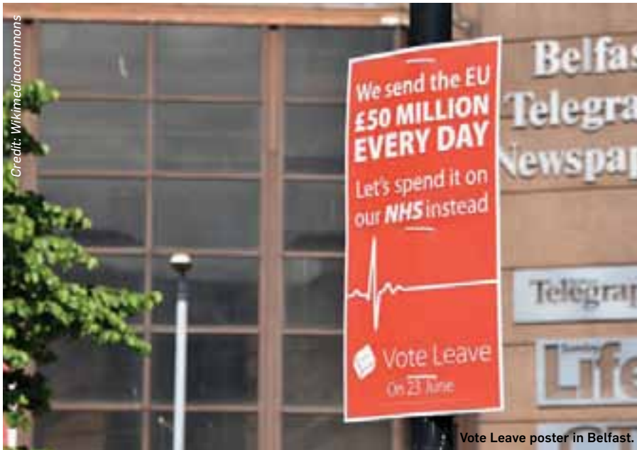
Vote Leave poster in Belfast.

“AS THIS IS THE FIRST TIME AN EXIT IS TAKING PLACE IN THE EU AS WELL AS GIVEN THE COMPLEXITIES AND INTRICACIES OF AGREEMENTS AND TREATIES BETWEEN THE TWO, THE NEGOTIATIONS PROMISE TO BE ARDUOUS AND THUS THE SEPARATION MAY TAKE LONGER THAN TWO YEARS.”