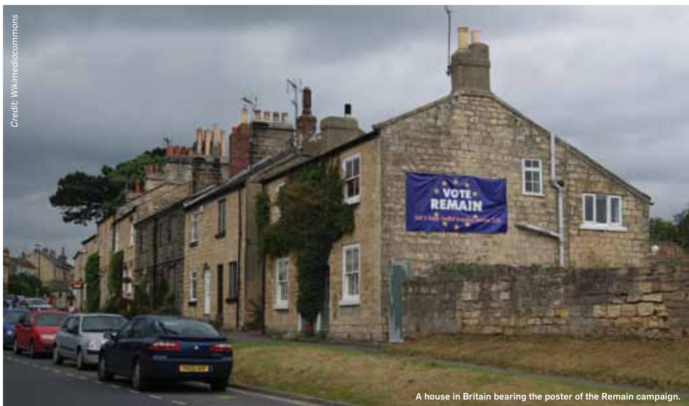
A house in Britain bearing the poster of the Remain campaign.

At the front and center of the Leave campaign was the immigration issue. Free movement of people – no travel, domicile and working restrictions for EU nationals in another EU country – is one of the four freedoms that have made the EU what it is today. But it was also blamed for job loss, low wages and diminishing quality of life of locals.