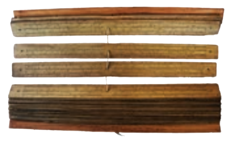
Palm-leaf manuscript (lontar) from Bali, of a Sanskrit-Old Javanese Buddhist text entitled Sang Hyang Kamahayanikan. This manuscript is kept at the Leiden University Library