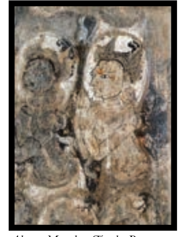
Above: Mural at Tayoke Pyay temple, Bagan, circa.13th century