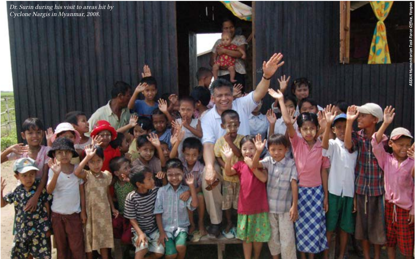
ASEAN Humanitarian Task Force Office, Yangon

Research, policy, business and civil society communities across Southeast Asia have reacted with shock and sadness to the sudden death of former Thai foreign minister Surin Pitsuwan, 68, on 30 November 2017.