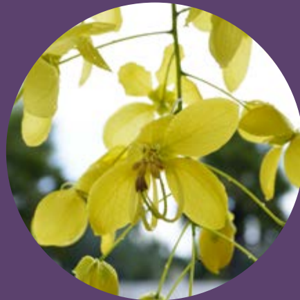
The national flowers of Myanmar, the Philippines, Thailand and Vietnam (clockwise from top left): padauk, jasmine, ratchaphruk and pink lotus.