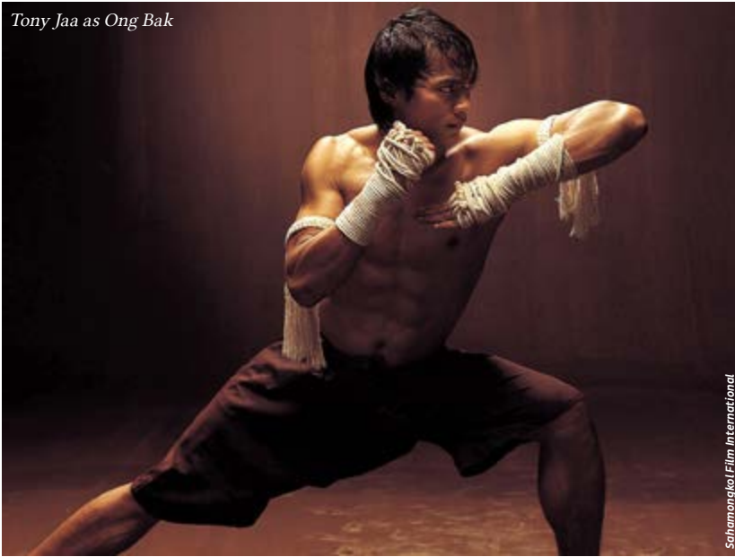
Sahamongkol Film International