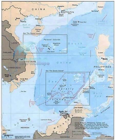
The "9-dash line" map (1988)

The very way Southeast Asia is conceived as a region could be under challenge. And this challenge manifests the shared grand strategic fear behind the formation and expansion of ASEAN.