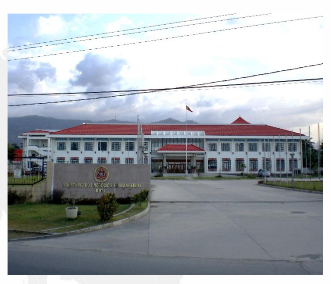
Ministry of Foreign Affairs and Cooperation in Dili.

ASEAN makes decision by consultation and consensus. Thus, every member state is expected to be represented at every ASEAN meeting, especially the high-level Summit and ministerial meetings, and participate in formulating policy decisions. Every member government is also obliged to implement all ASEAN commitments in good faith with best national effort. Any laxity in implementation could cause detrimental delays for ASEAN's regional integration exercise.