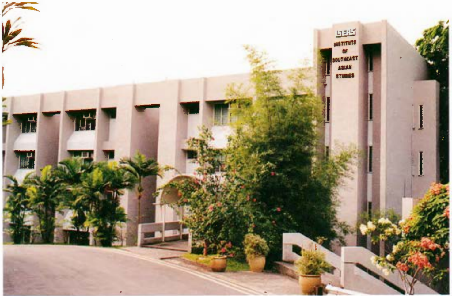
The Institute of Southeast Asian Studies, Heng Mui Keng Terrace, Singapore 0511.