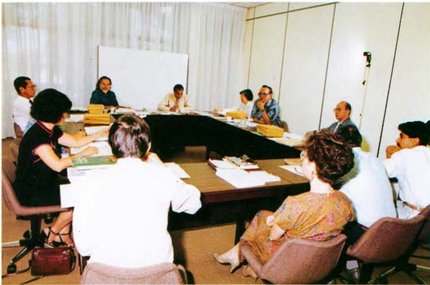
Members of the Regional Advisory Council in close discussion with staff of the Institute.