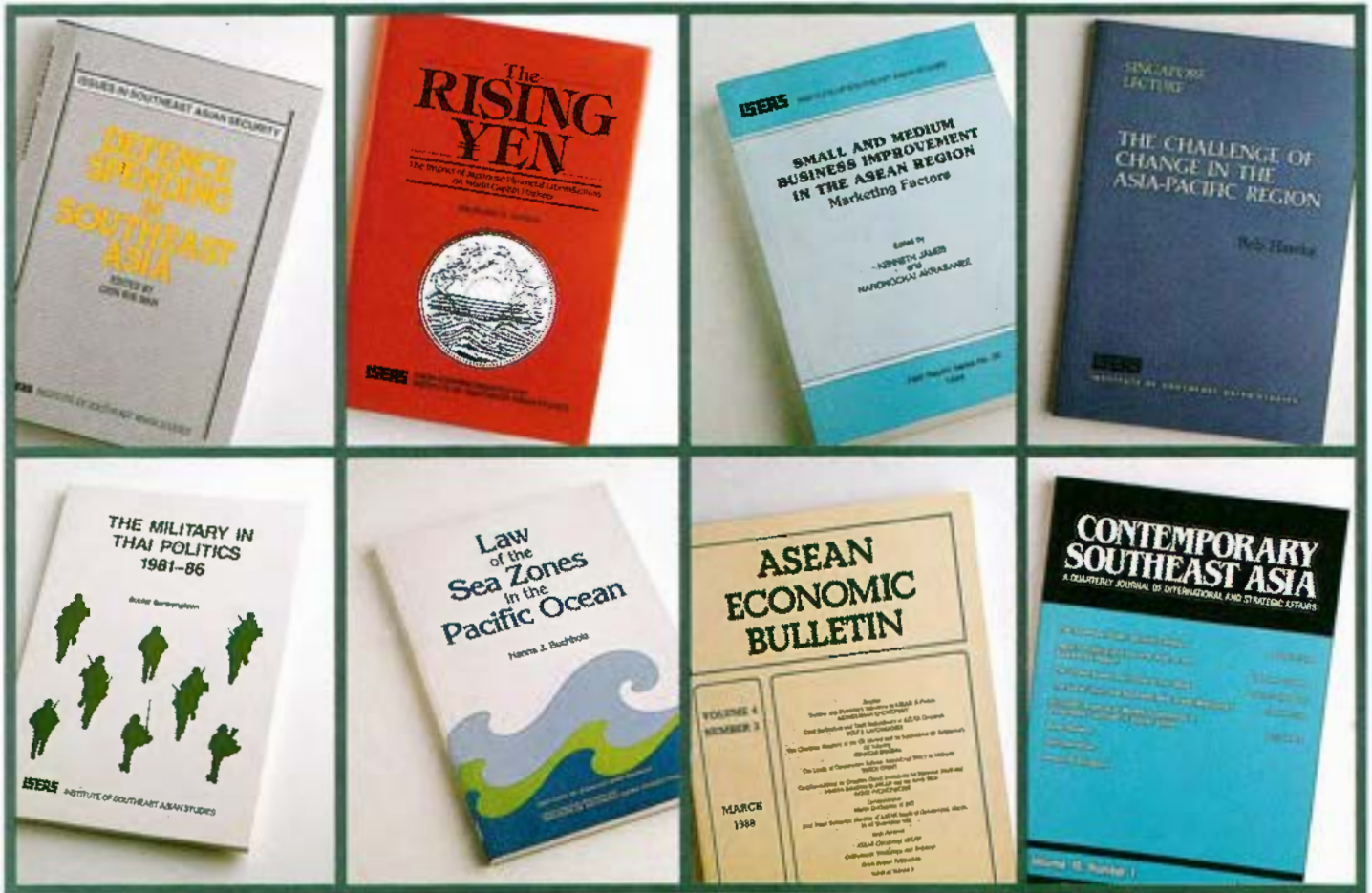
Publications of the Institute.