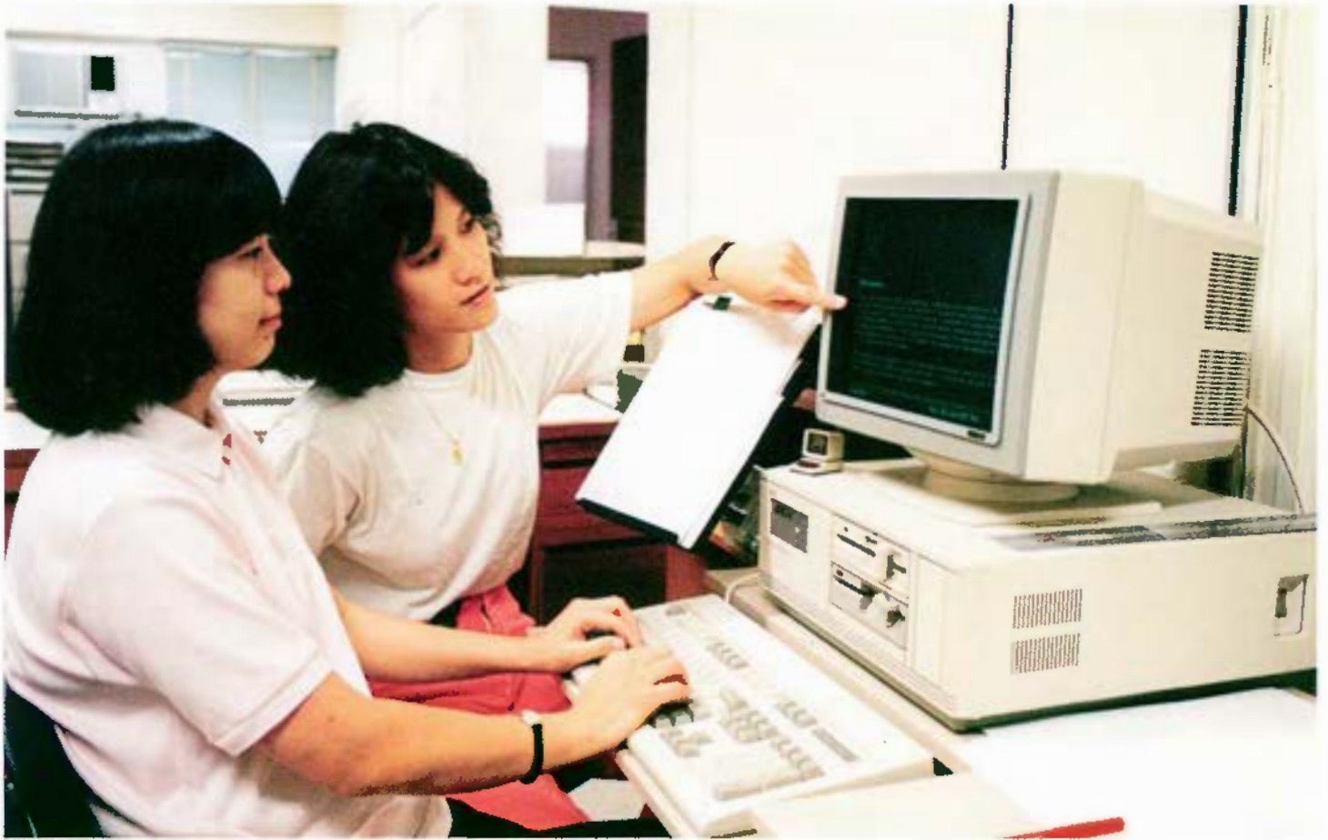
Keeping abreast with information technology -- support staff are trained for greater efficiency using computers.