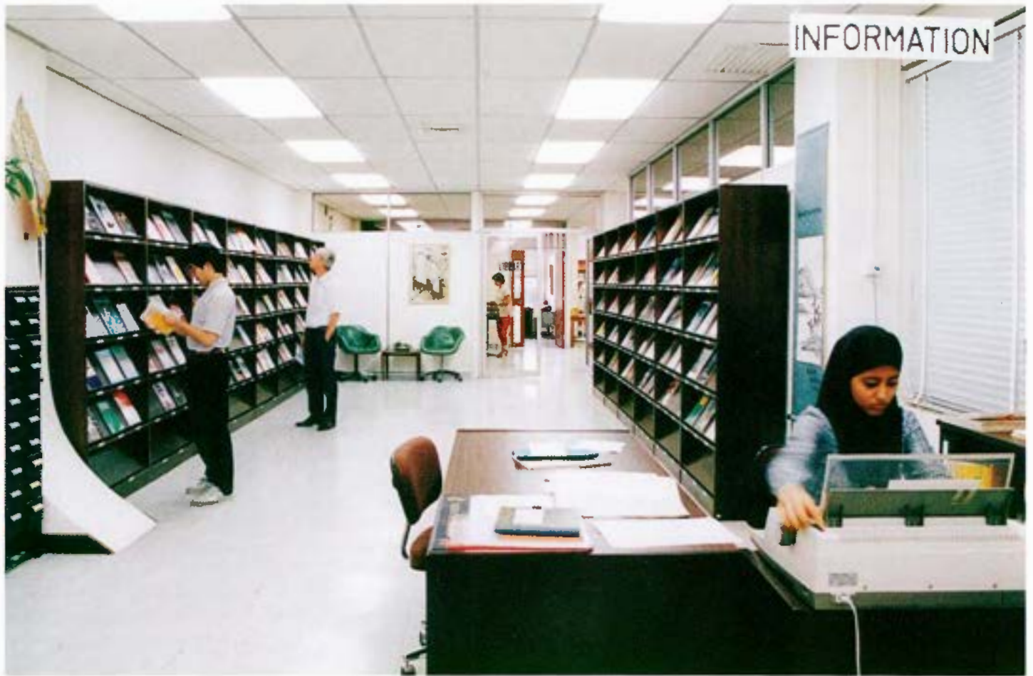
Some of the large journal collection on display in the Library.