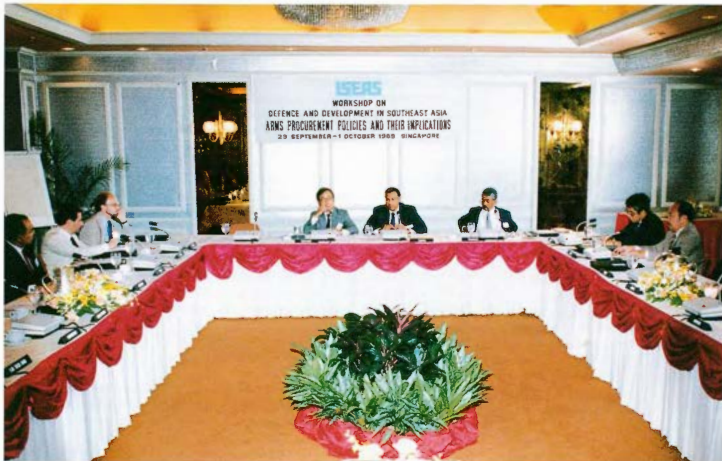
Presentation of papers at the Workshop on Defence and Development in Southeast Asia: Arms Procurement Policies and Their Implications, held in Singapore from 29 September to 1 October 1988.