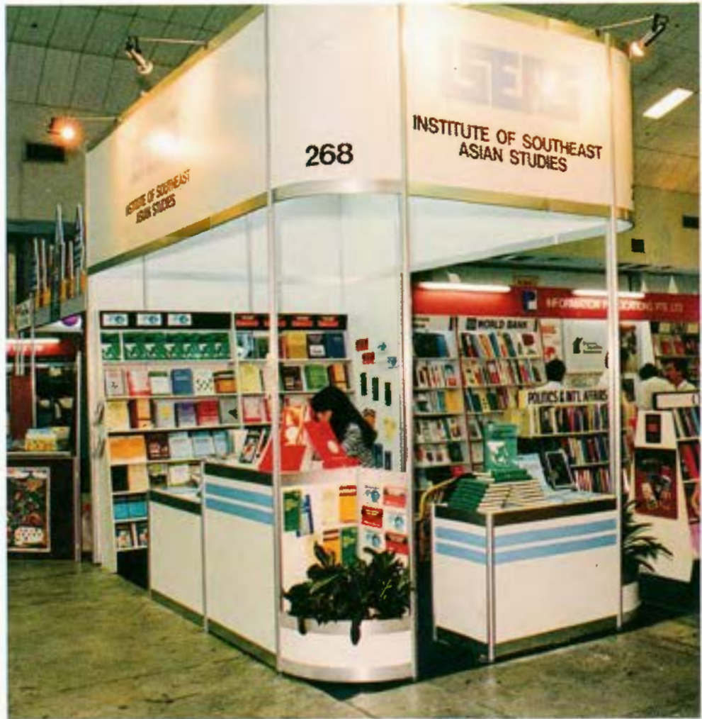
The Institute frequently promotes its publications by participating in both local and foreign exhibitions such as the Singapore Book Fair 1988.