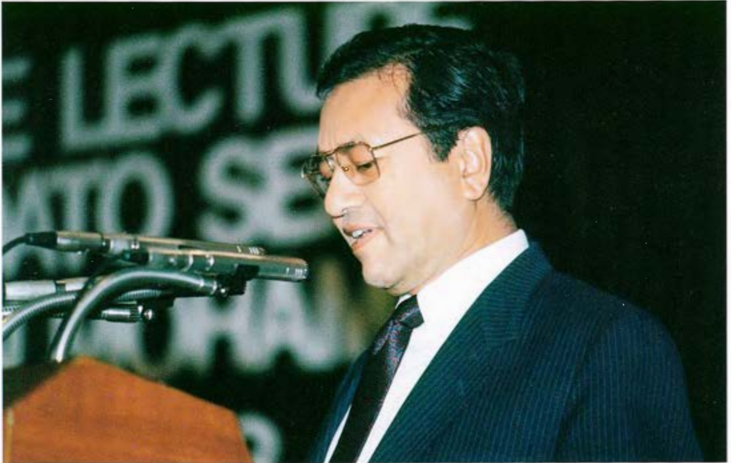
The Honourable Dato Seri Dr Mahathir bin Mohamad, Prime Minister of Malaysia, delivering the 1988 Singapore Lecture on "Regionalism, Globalism, and Spheres of Influence: ASEAN and the Challenge of Change into the 21st Century".