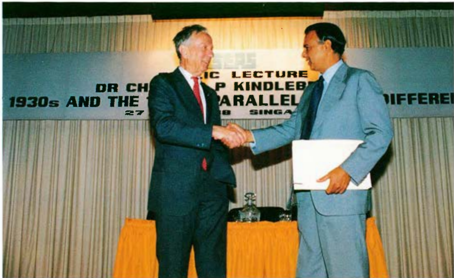
The Director welcoming Dr Charles P. Kindleberger, Ford International Professor of Economics Emeritus, Massachusetts Institute of Technology, to deliver his public lecture on "The 1930s and the 1980s: Parallels and Differences".