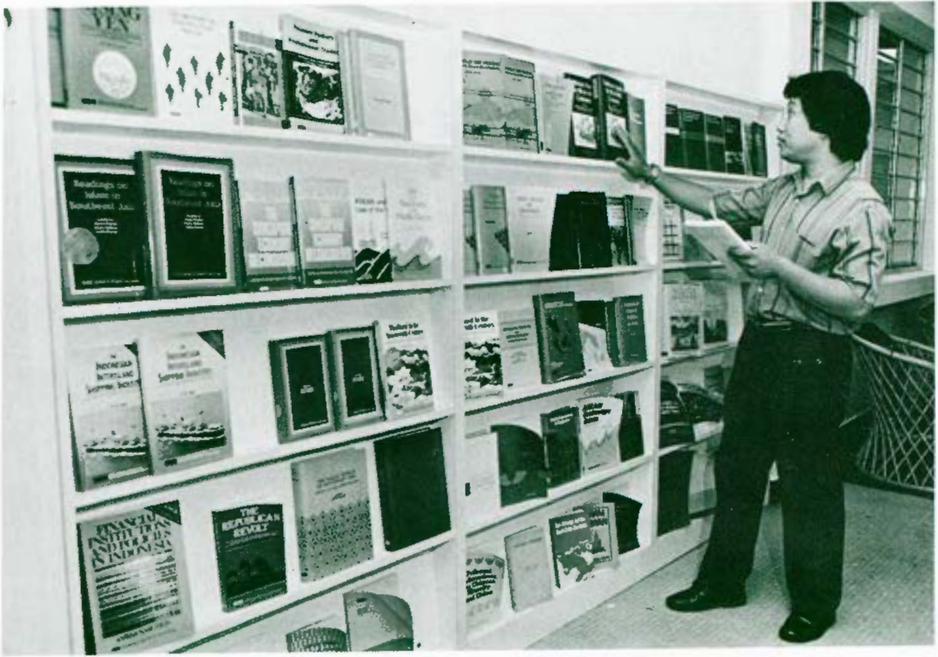
A selection of some of ISEAS publications on display at the Institute.