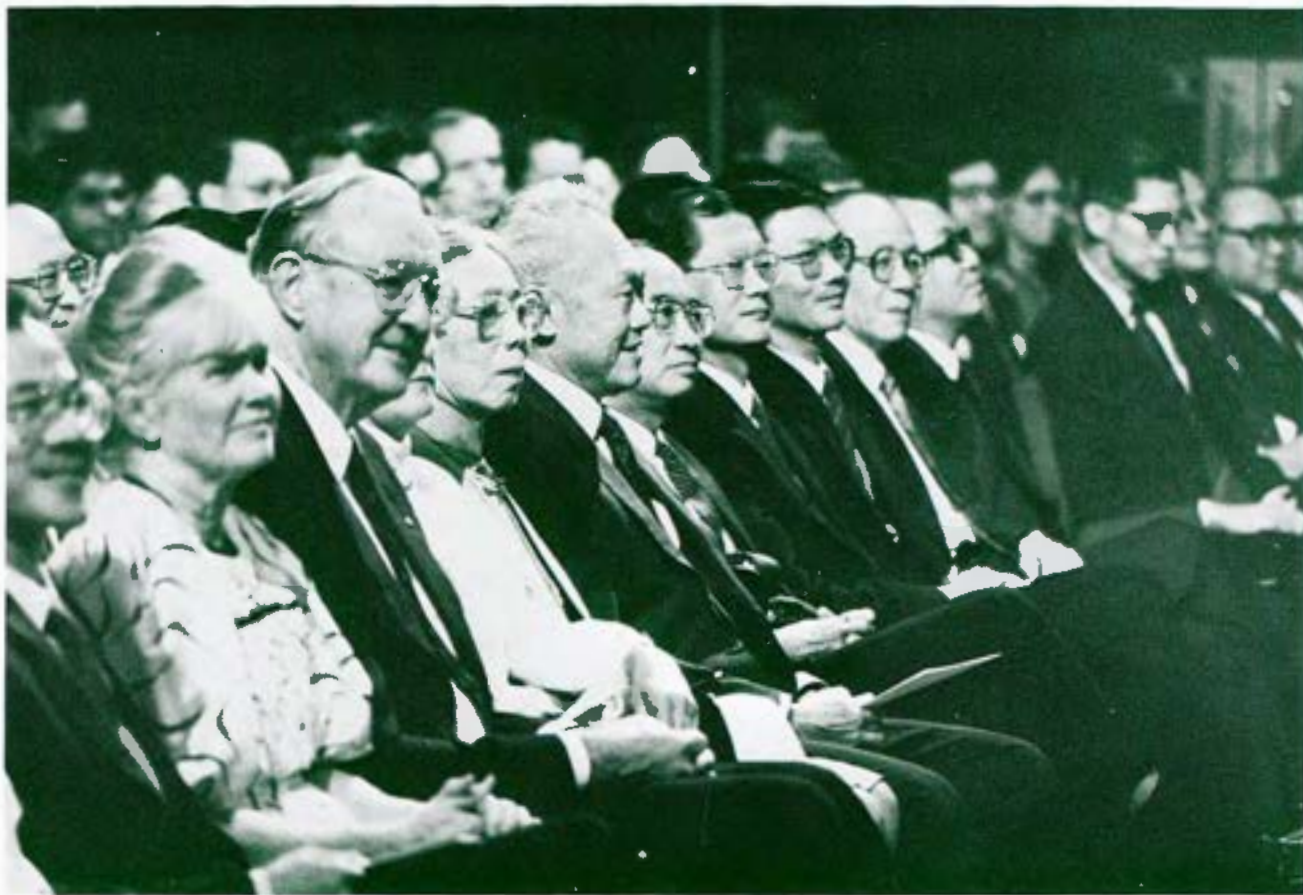
▲ The 1987 Singapore Lecture was attended by a capacity audience including Prime Minister Lee Kuan Yew and Mrs Lee at the Singapore Conference Hall. ►