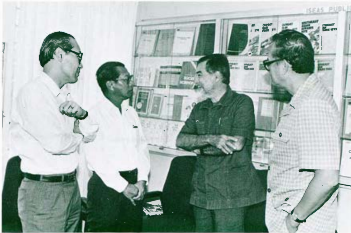
Members of the Regional Advisory Council at ISEAS in August 1987. From left: Professor Wang Gungwu, Vice-Chancellor, University of Hong Kong, and former Director of the Research School of Pacific Studies, Australian National University, Canberra (Professor of Far Eastern History); Professor Kasem Suwanagul, Rector, Chulalongkorn University, Bangkok, and former Minister for University Affairs, Thailand (Professor of Politics); Royal Professor Ungku Aziz, Vice-Chancellor, University of Malaya, Kuala Lumpur (Professor of Economics); and Professor Harsja Bachtjar, Head, Office of Educational and Cultural Research and Development, Department of Education and Culture, and former Dean, Faculty of Letters, University of Indonesia, Jakarta (Professor of Sociology and Social History).