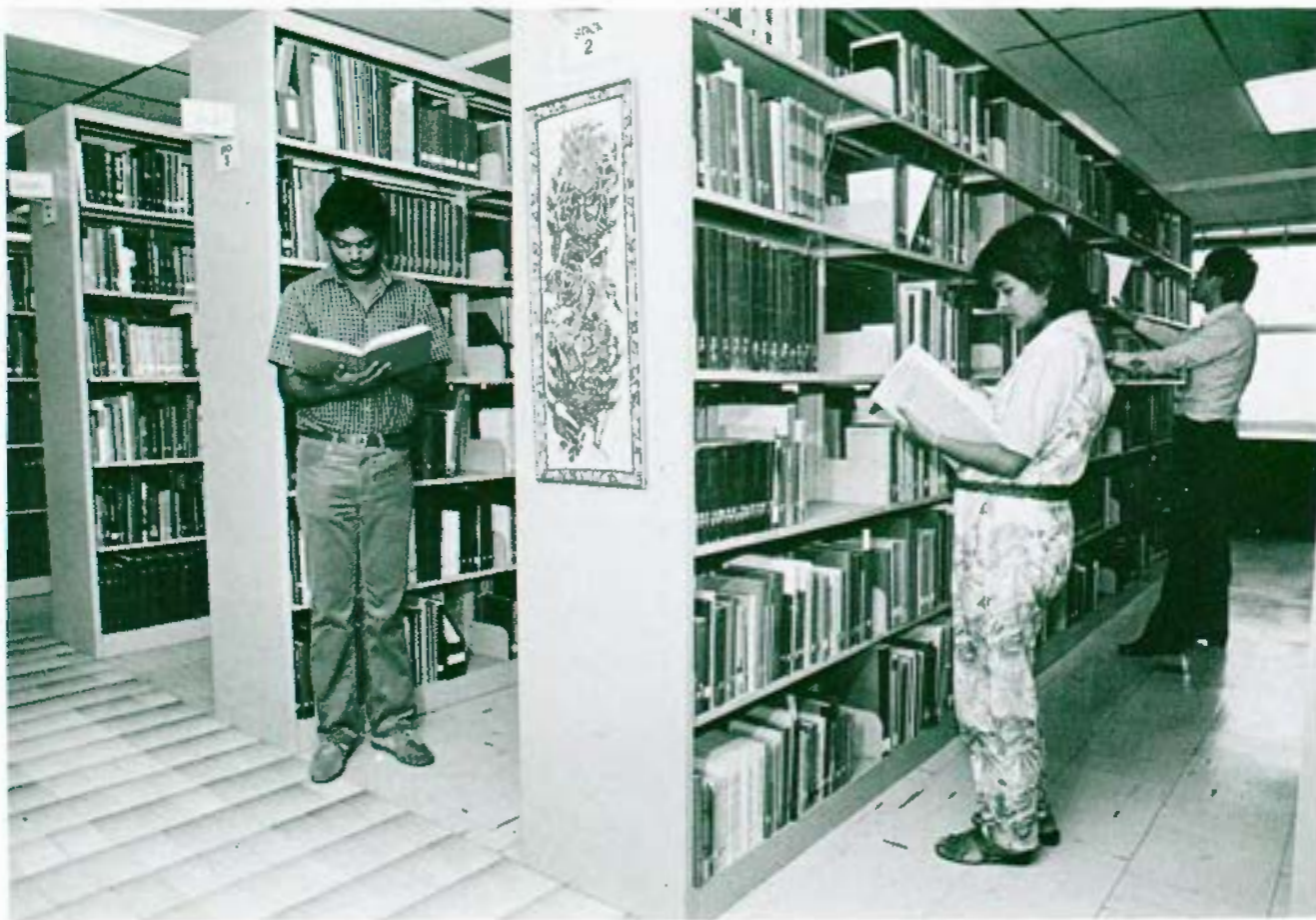
A section of the extensive collection of the Library.