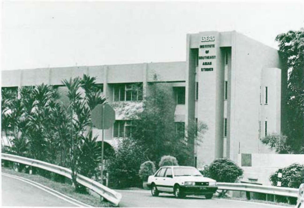
The Institute of Southeast Asian Studies, Heng Mui Keng Terrace, Singapore 0511.