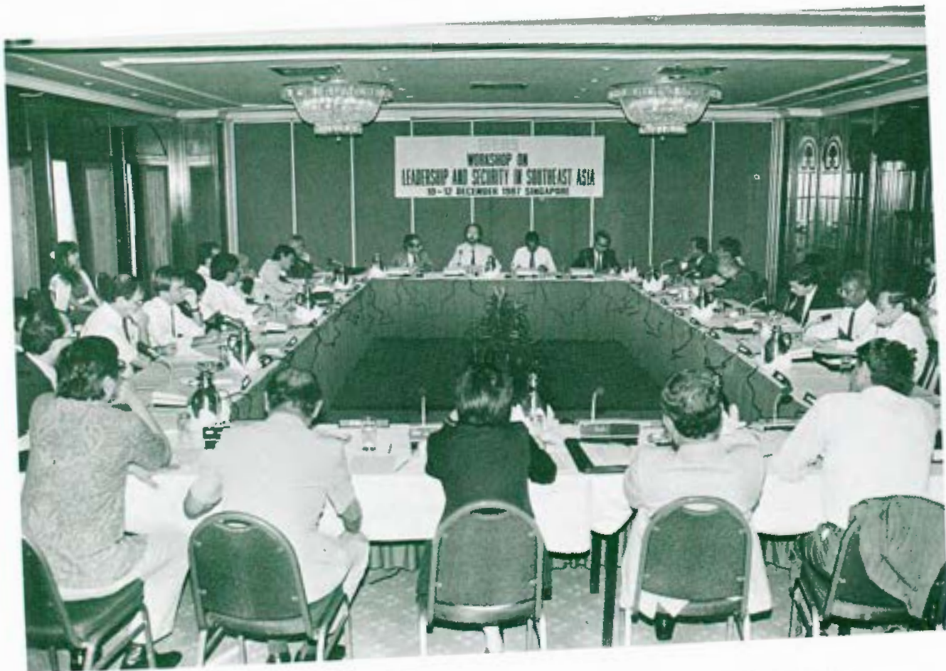
Presentation of papers during the Workshop on Leadership and Security in Southeast Asia organized by ISEAS on 10-12 December 1987.