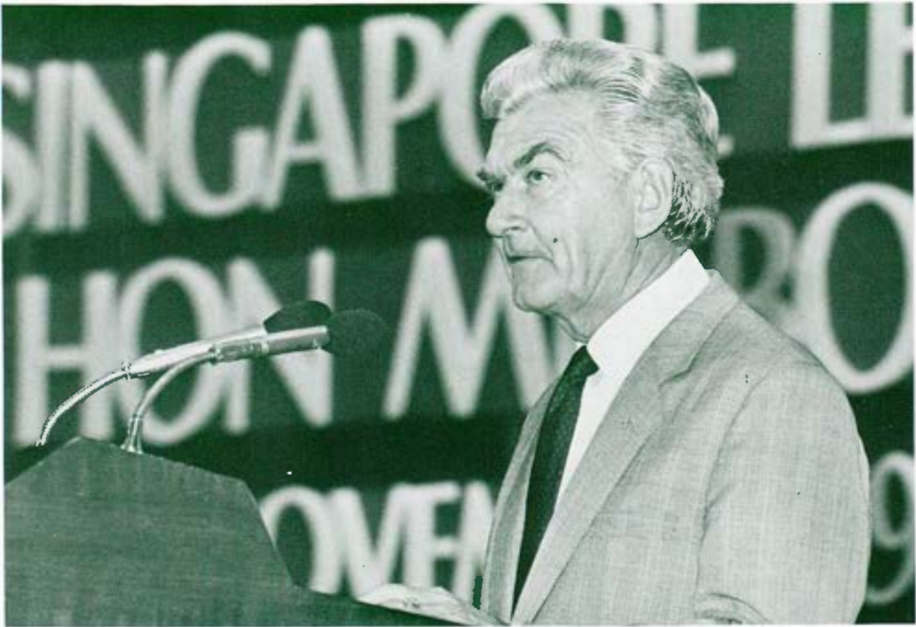
The Honourable Mr Bob Hawke, Prime Minister of Australia, delivering the 1987 Singapore Lecture on "The Challenge of Change in the Asia-Pacific Region".