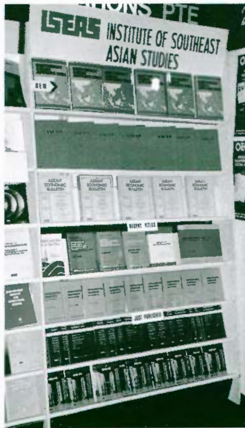
A display of ISEAS publications showing some of the award winning titles.