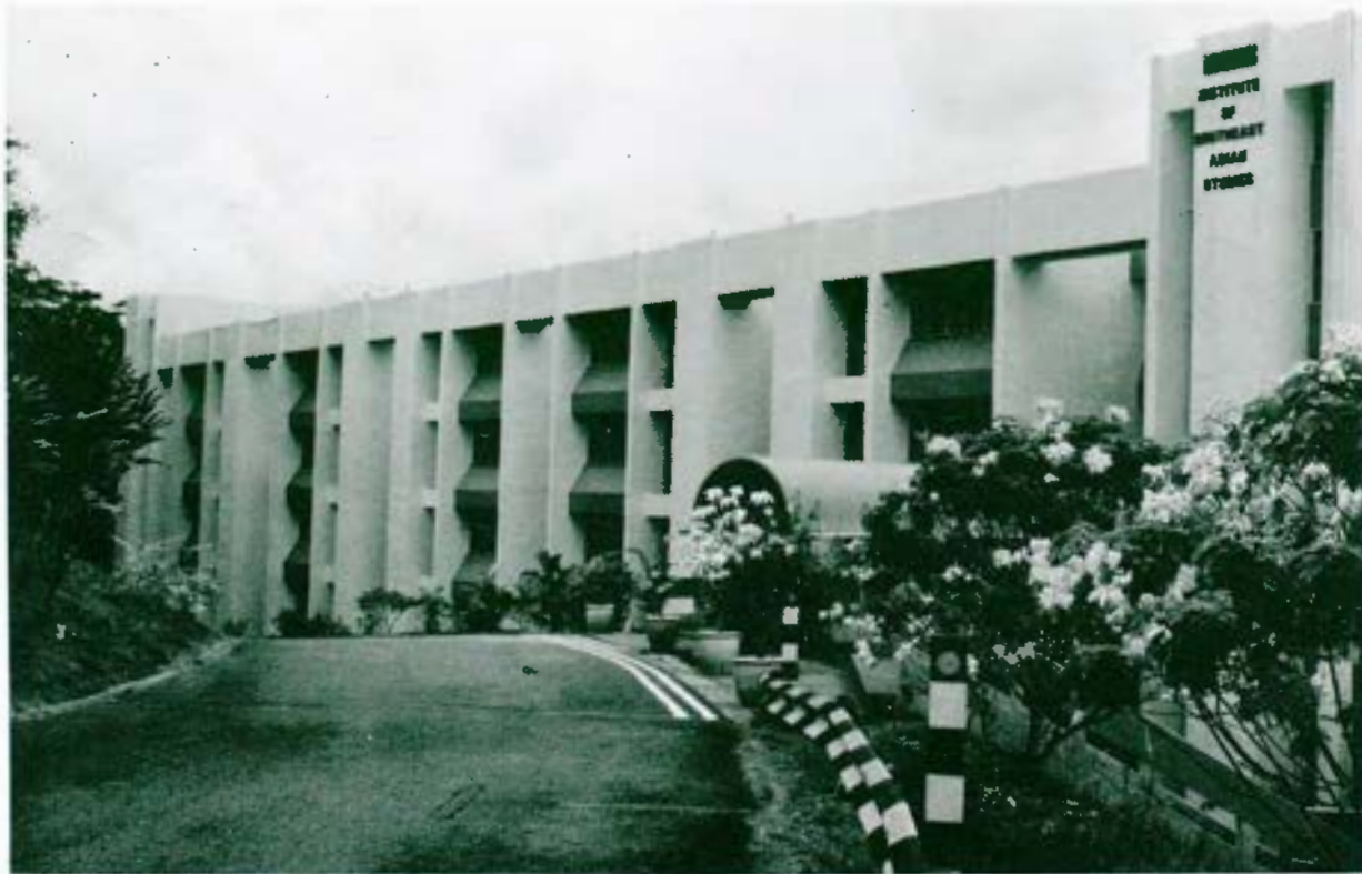
The Institute of Southeast Asian Studies, Heng Mui Keng Terrace, Singapore 0511