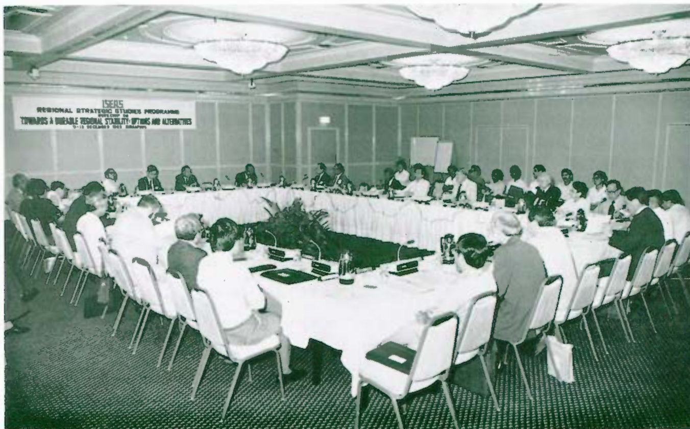
The Opening Session of the Workshop on Towards a Durable Regional Stability: Options and Alternatives, 11–13 December 1985, organized by the Institute in Singapore under the Regional Strategic Studies Programme.