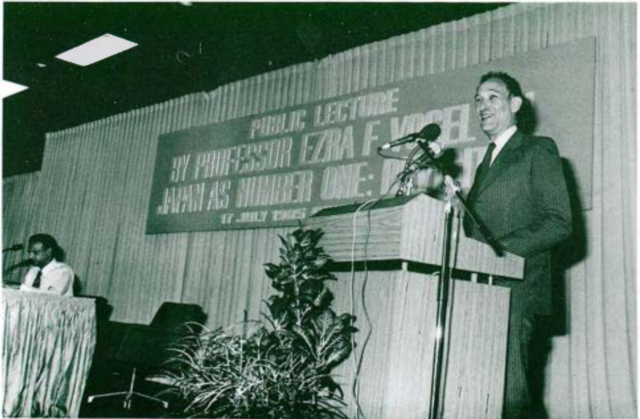
Professor Ezra F. Vogel delivering his Public Lecture on Japan as Number One: Revisited, at the RELC Auditorium on 17 July 1985.