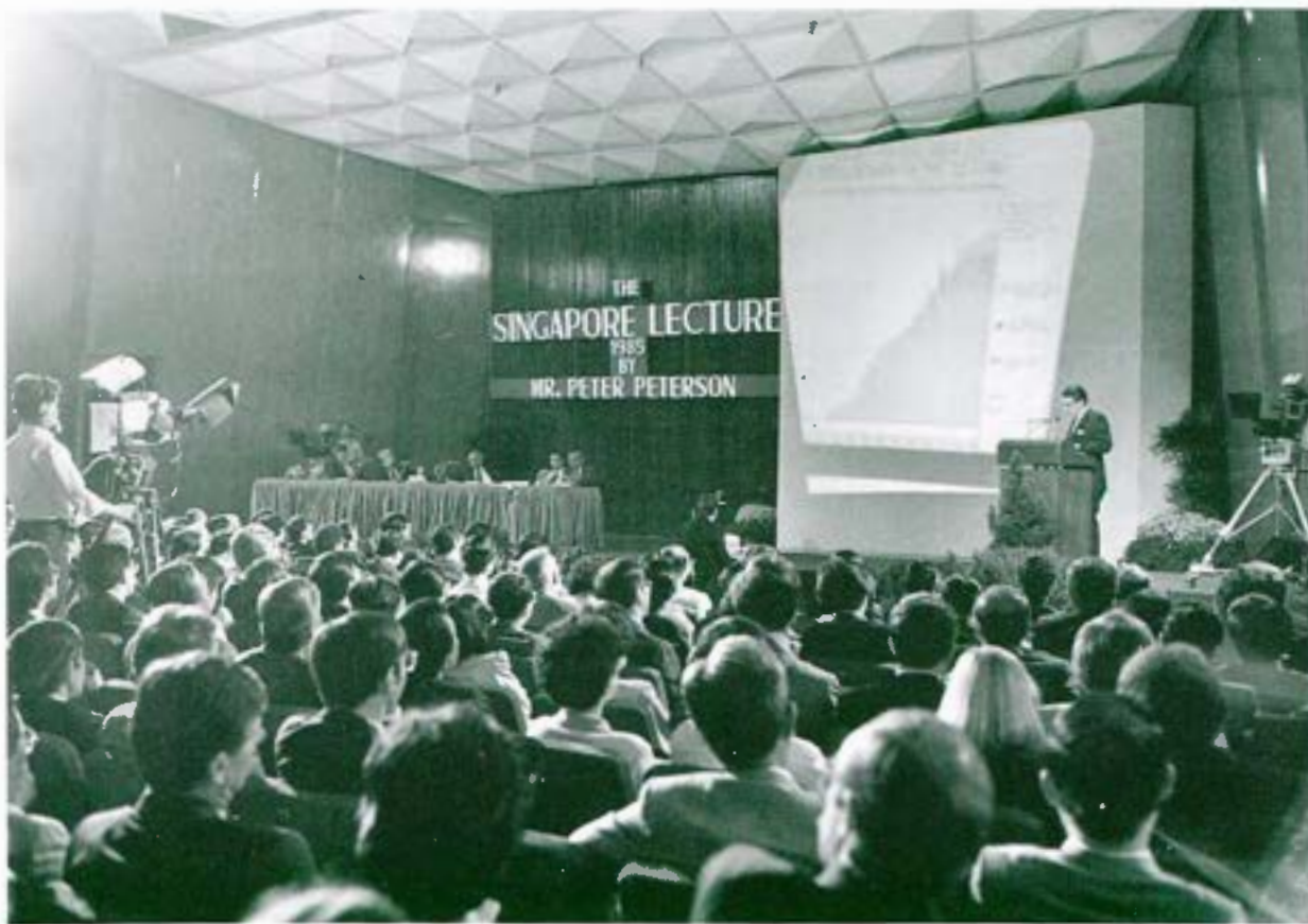
Mr Peter G. Peterson delivering the 1985 Singapore Lecture on "Deficits, Debts, and Demographics: Three Fundamentals Affecting our Long-Term Economic Future".