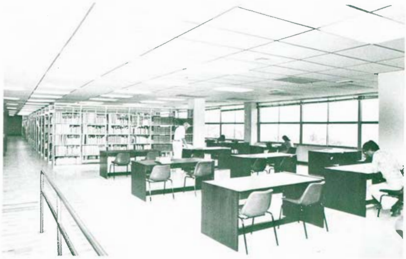
The spacious library of the Institute.