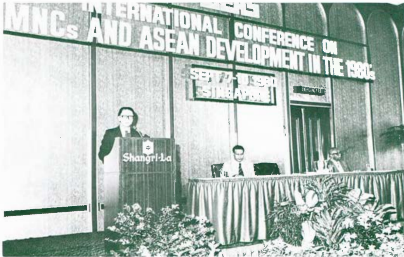
The Singapore Minister for Education, Dr. Tony Tan Keng Yam, delivering the Opening Address at the Conference on "MNCs and Asean Development in the 1980s".