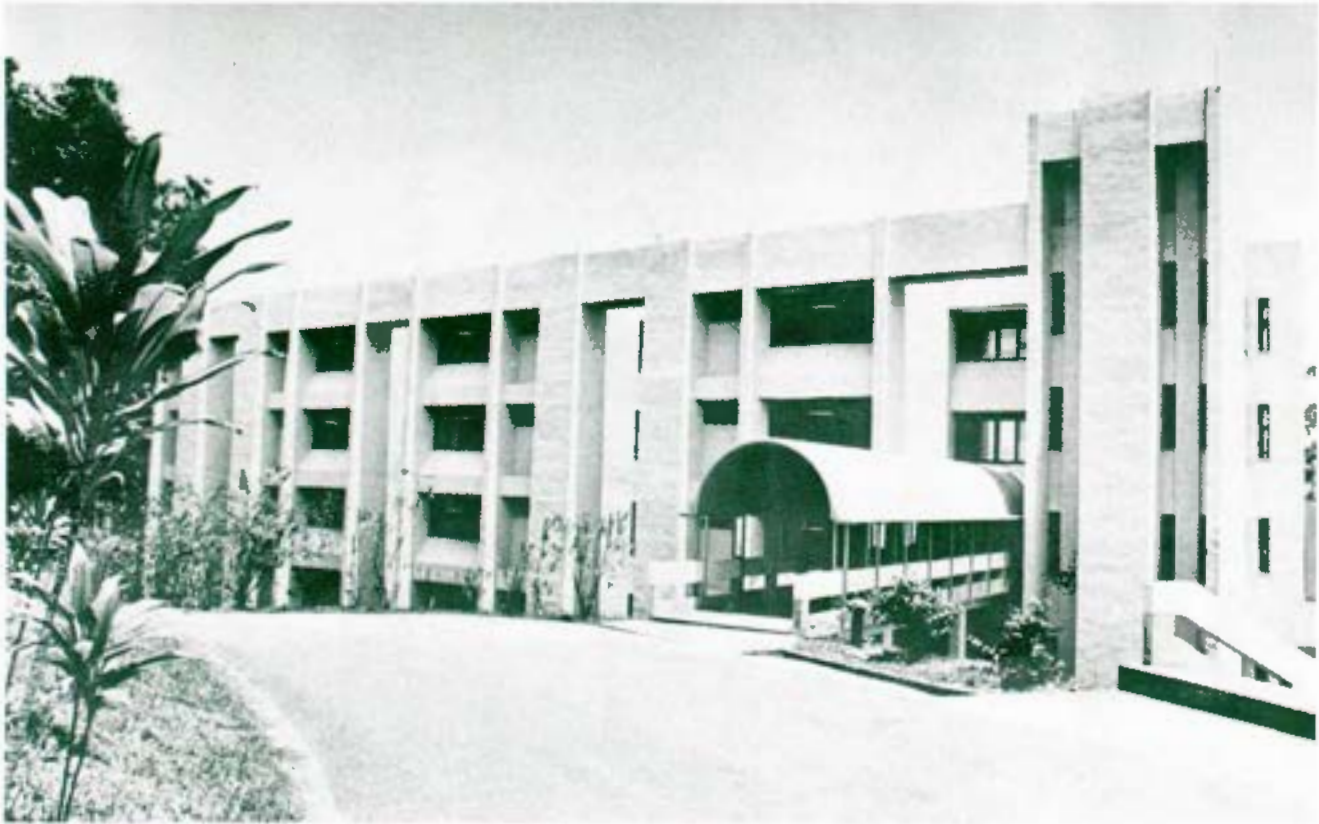
ISEAS at Heng Mui Keng Terrace, Pasir Panjang, Singapore 0511.