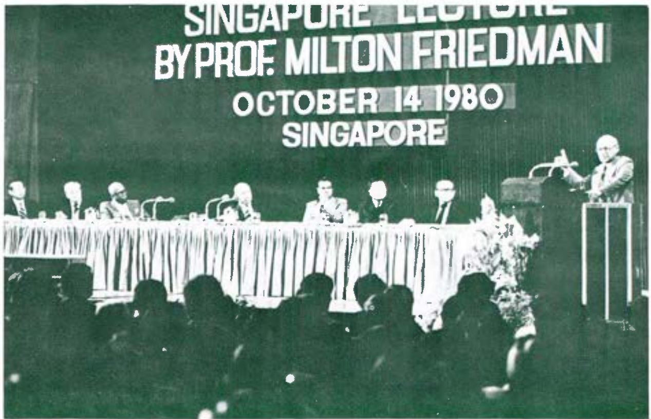
Professor Milton Friedman delivering his address at the inaugural Singapore Lecture.