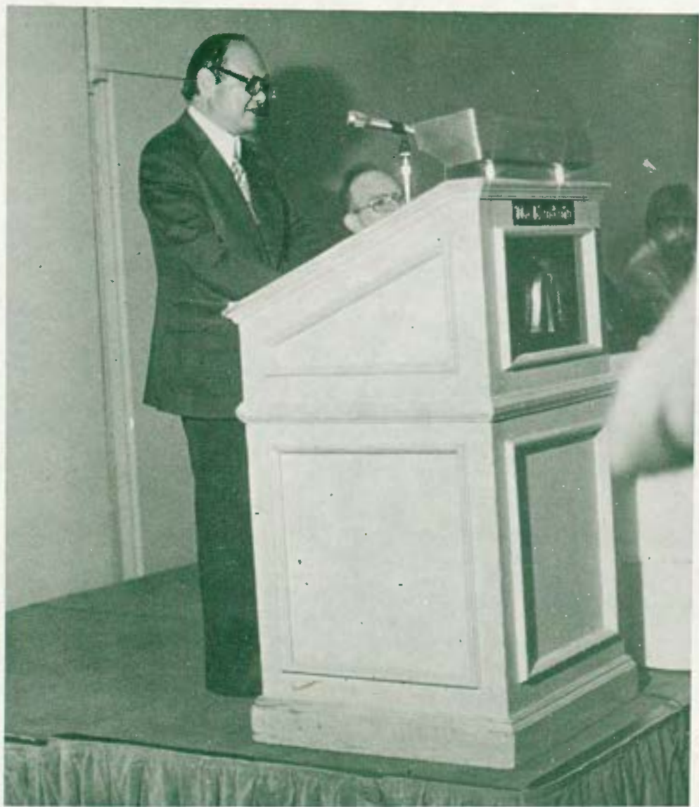
The Philippine Acting Foreign Minister, Hon. Jose D. Ingles, delivering the keynote address at the ICLARM – ISEAS Law of the Sea Workshop in Manila.