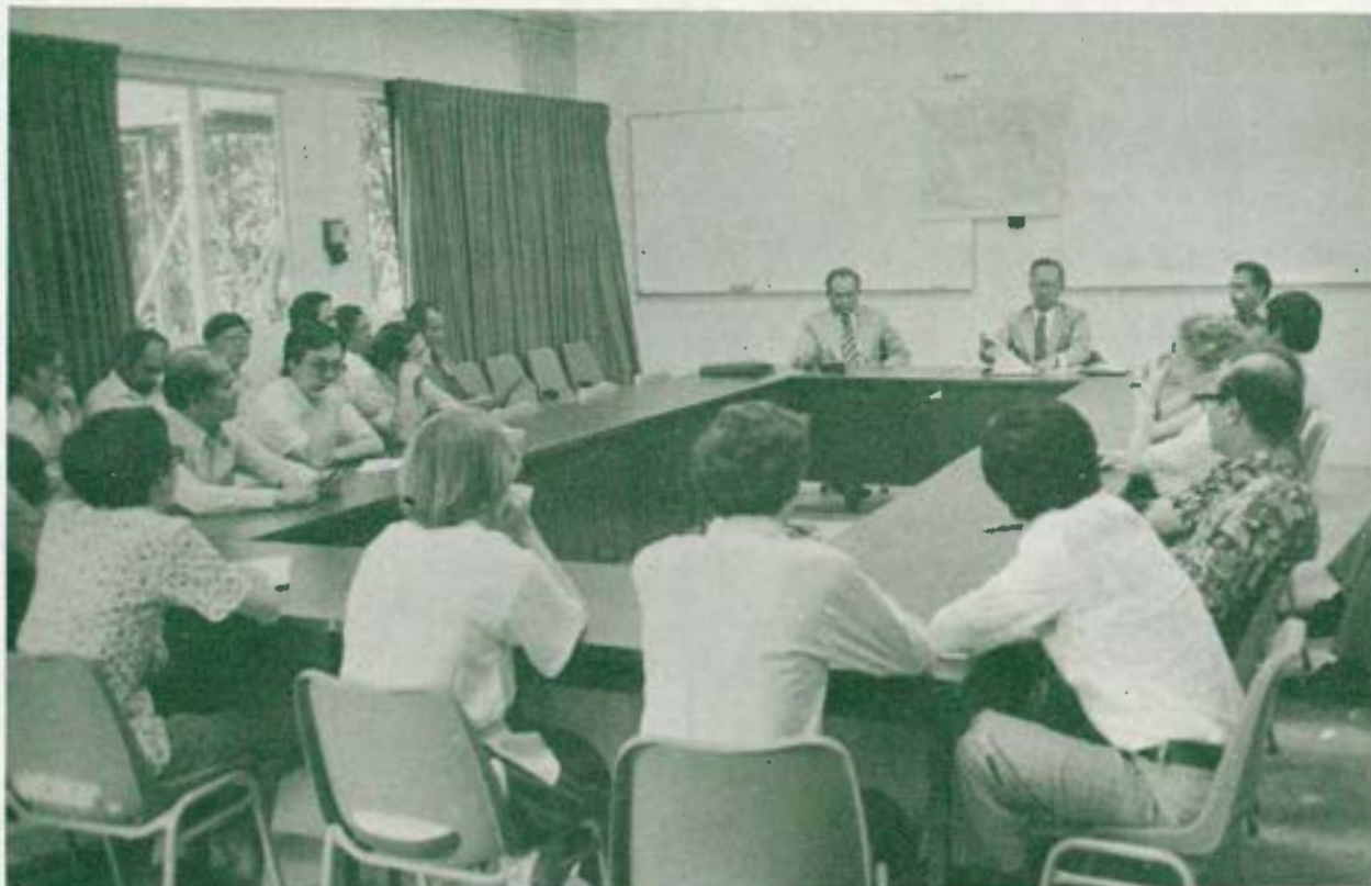
H.E. Professor Dr. Mochtar Kusumaatmadja leading the discussion