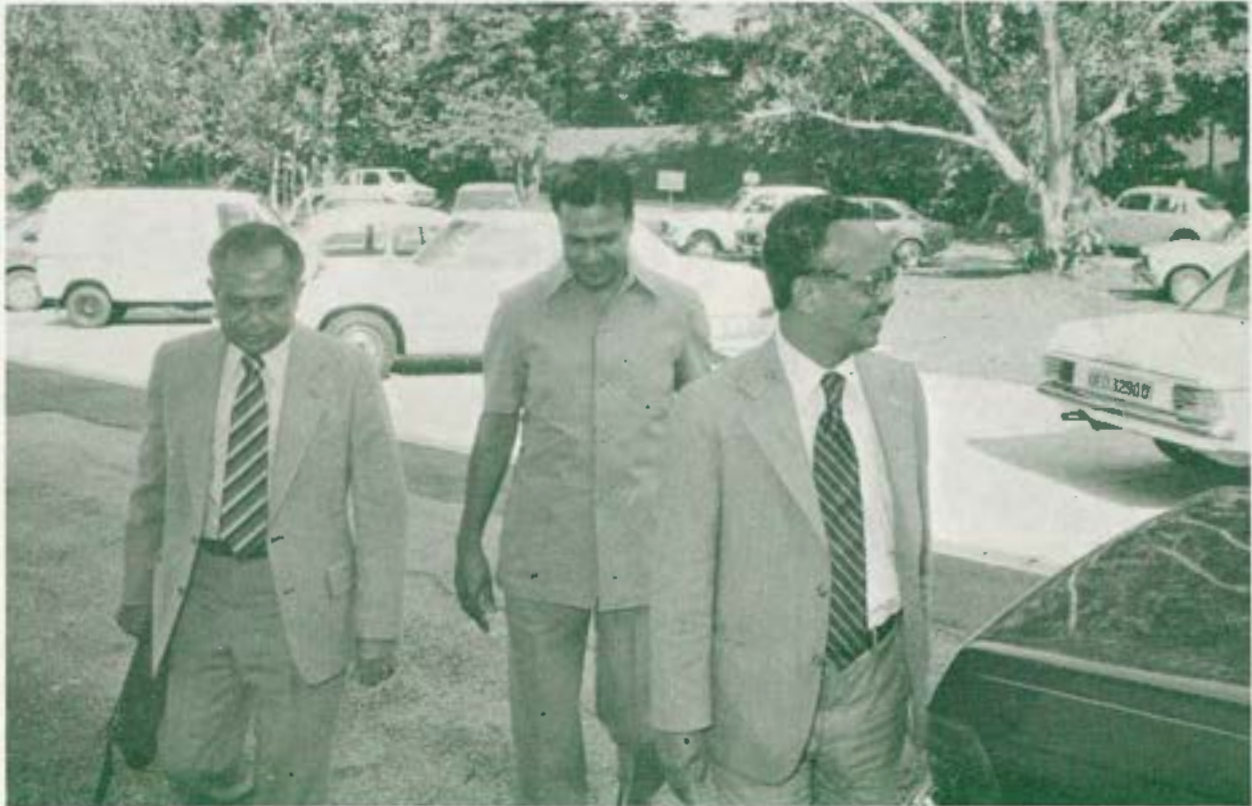
H.E. Professor Dr. Mochtar Kusumaatmadja, the Foreign Minister of Indonesia, arriving at the Institute to participate in a Seminar