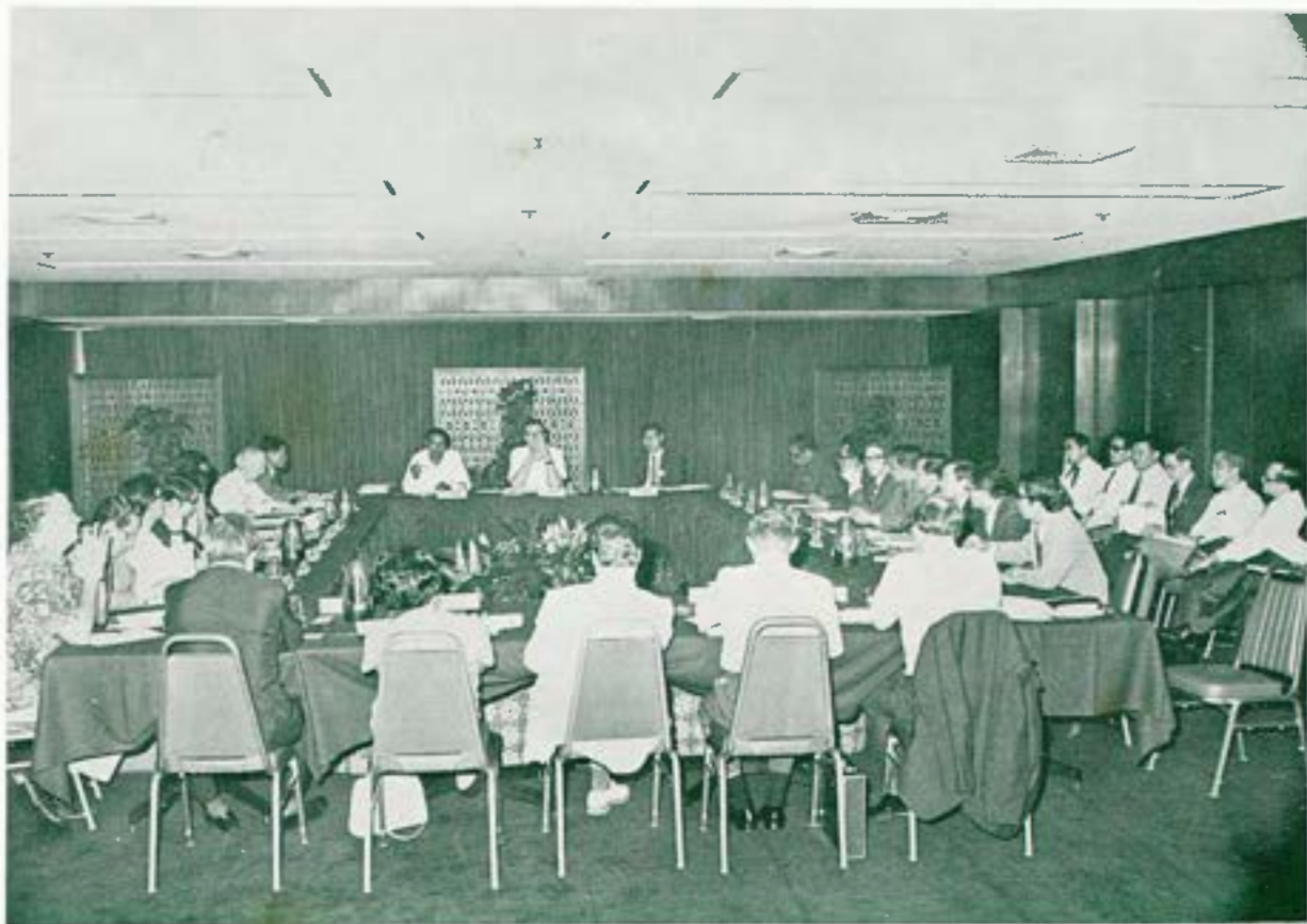
One of the Institute's Seminars in Progress.