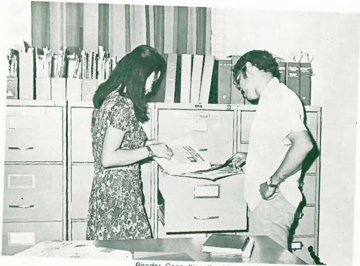
Reader Consulting the Library's Press Cuttings Collection.