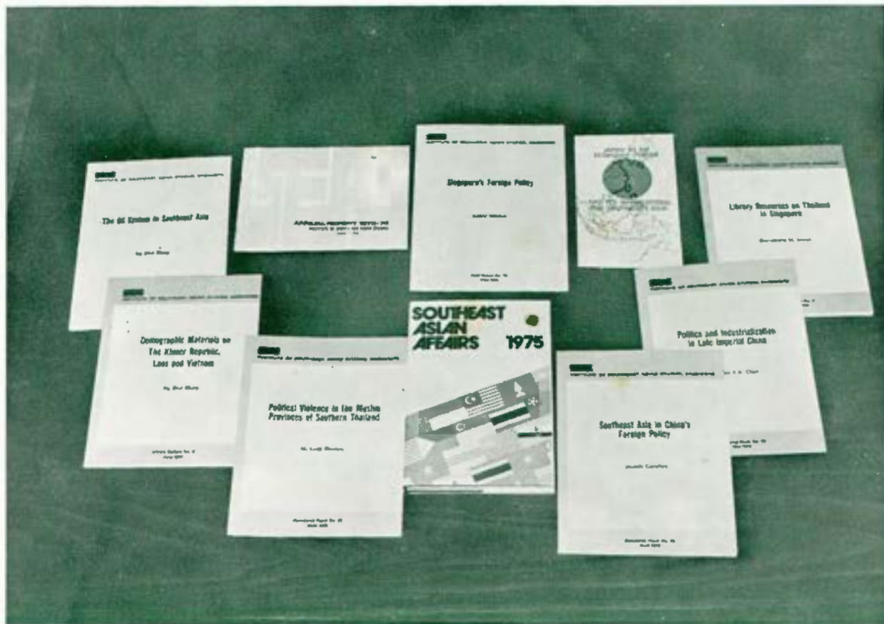
Some Recent Publications of the Institute.