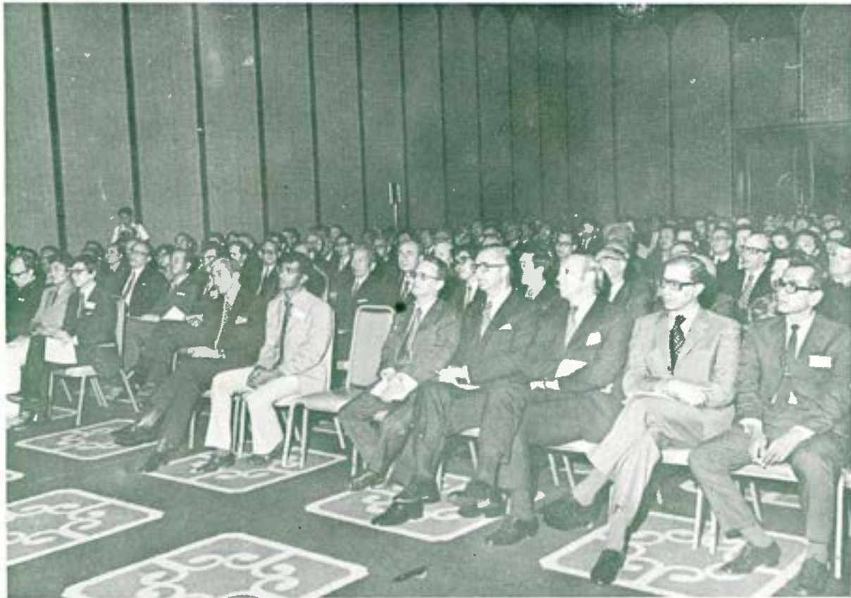
A section of the audience listening to the Prime Minister.