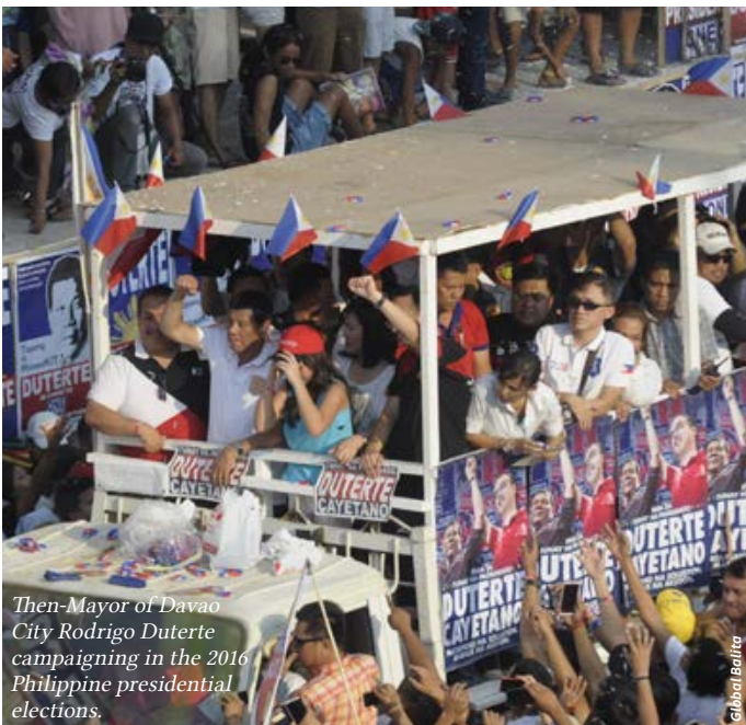
Then-Mayor of Davao City Rodrigo Duterte campaigning in the 2016 Philippine presidential elections.