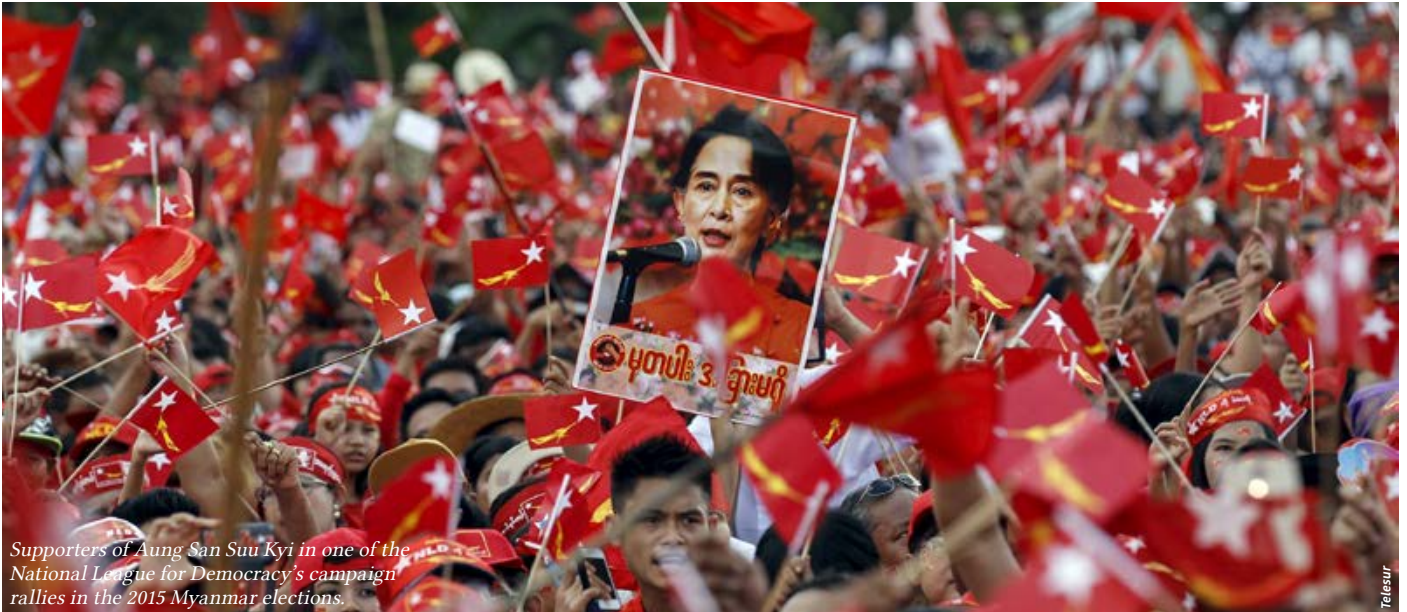
Supporters of Aung San Suu Kyi in one of the National League for Democracy's campaign rallies in the 2015 Myanmar elections.