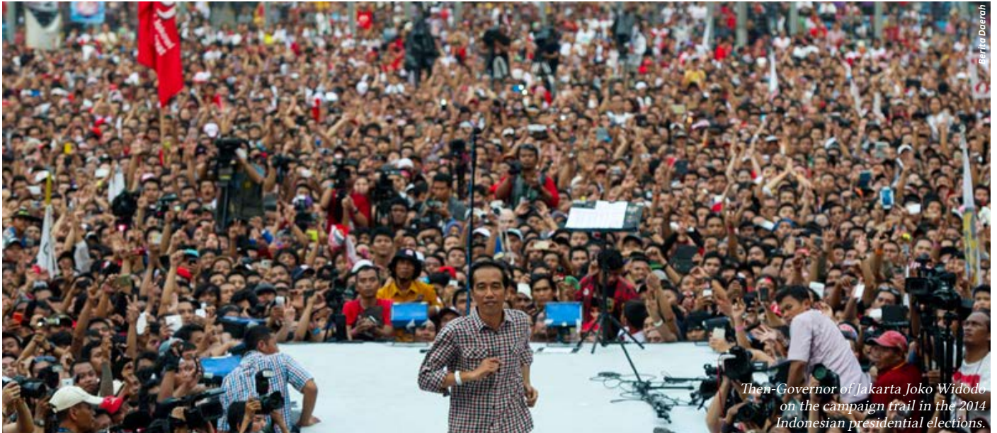
Then-Governor of Jakarta Joko Widodo on the campaign trail in the 2014 Indonesian presidential elections.