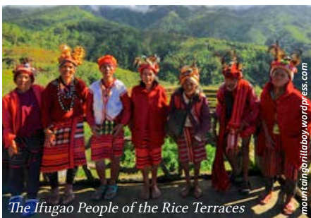
The Ifugao People of the Rice Terraces