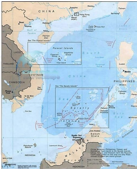
The “9-dash line” map (1988)