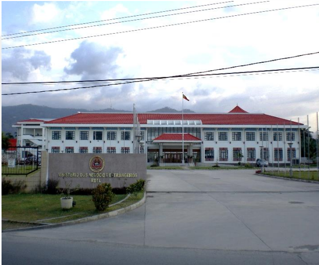
Ministry of Foreign Affairs and Cooperation in Dili.

ASEAN makes decision by consultation and consensus. Thus, every member state is expected to be represented at every ASEAN meeting, especially the high-level Summit and ministerial meetings, and participate in formulating policy decisions. Every member government is also obliged to implement all ASEAN commitments in good faith with best national effort. Any laxity in implementation could cause detrimental delays for ASEAN's regional integration exercise.