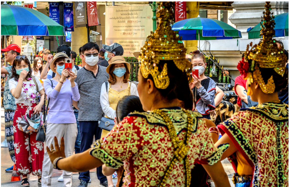
Chinese tourists with face masks watch a traditional Thai dance at the Erawan shrine, a popular spiritual landmark in Bangkok on 27 January 2020.