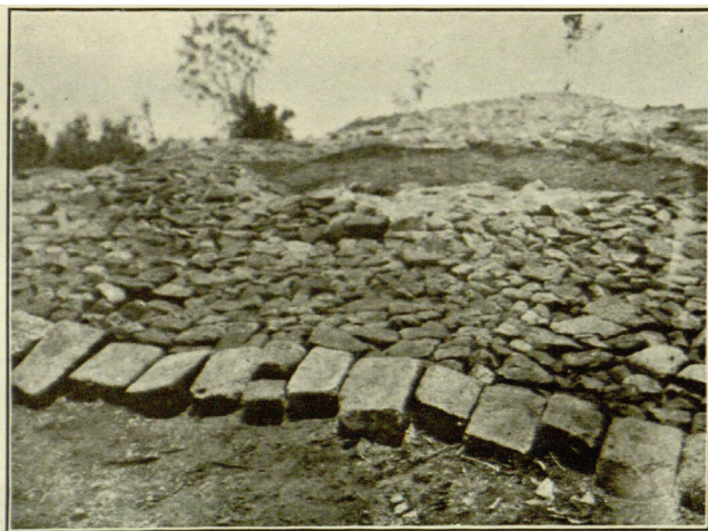
ANCIENT REMAINS ON KEDAH PEAK.

More solid evidence for Gunung Jerai as an old sacred site is provided by remains previously found and documented on the summit. Ancient building foundations, comprising extensive paving and brickwork,