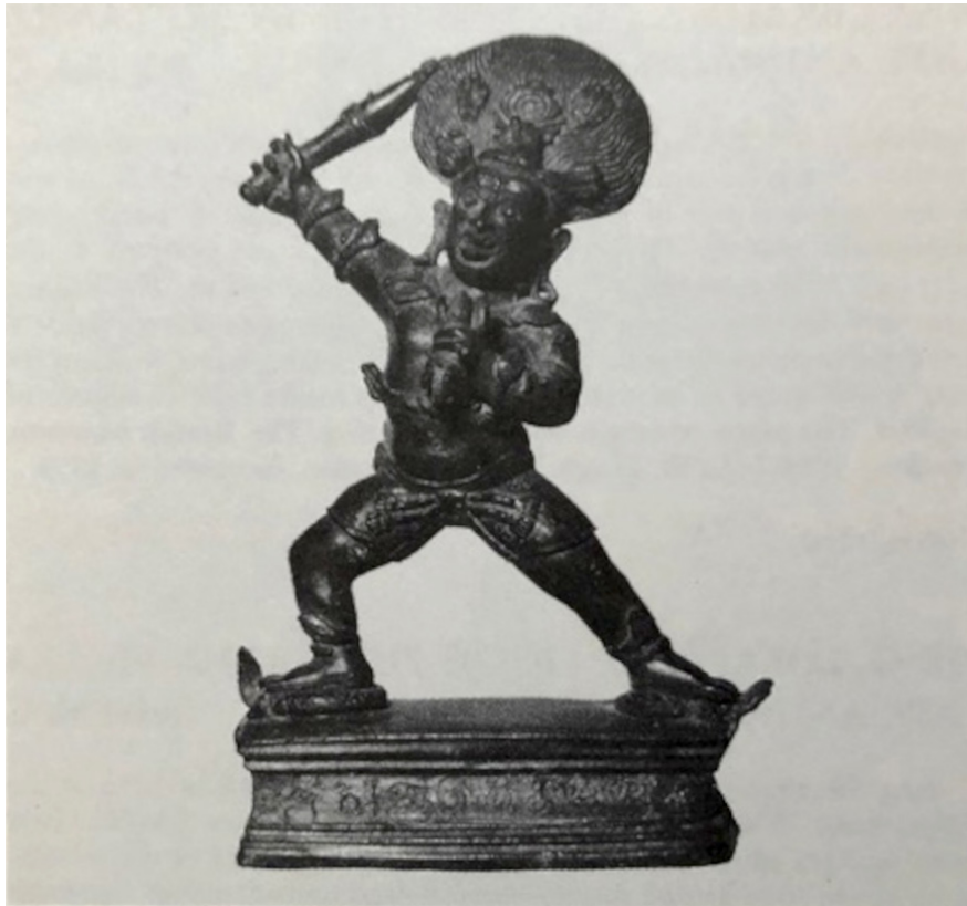
Fig. 8: Acala figurine with Tamil inscription recovered from Anuradhapura, Sri Lanka, c. 10th century.