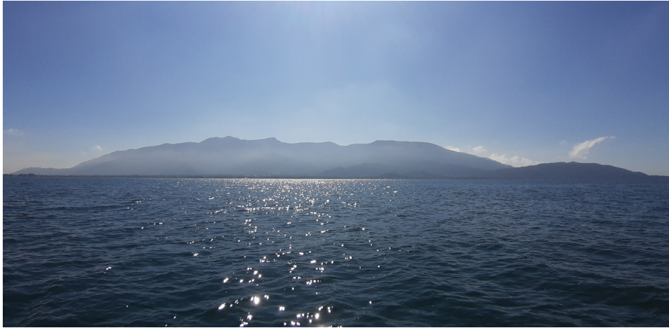
Fig. 3: Gunung Jerai viewed from the Malacca Strait. Public domain. < https://www.flickr.com/photos/j316/48960528448/in/photostream/ >

More solid evidence for Gunung Jerai as an old sacred site is provided by remains previously found and documented on the summit. Ancient building foundations, comprising extensive paving and brickwork,