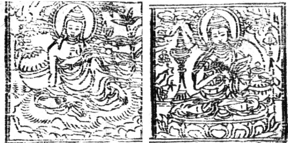
Fig. 1: ‘The Incomparable Golden Isles Dharmakīrti’ with palm trees (left); Atiśa in the Himalayas (right). From the frontispiece of a late blockprint ( Jo bo rje lha gcig dpal ldan A ti śas rgya gar du bstan pa ji ltar spel ba dang gser gling la phebs pa sogs kyi rnam thar ), MS shelfmark I.KERN 2740/H568a, Kern Institute, Leiden. < http://hdl.handle.net/1887.1/item:319806 >