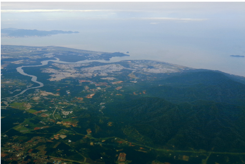
Fig. 2: Aerial view of Lembah Bujang, Kedah, Malaysia, showing Gunung Jerai (right), Sungai Merbok estuary (centre), and Penang (upper left).