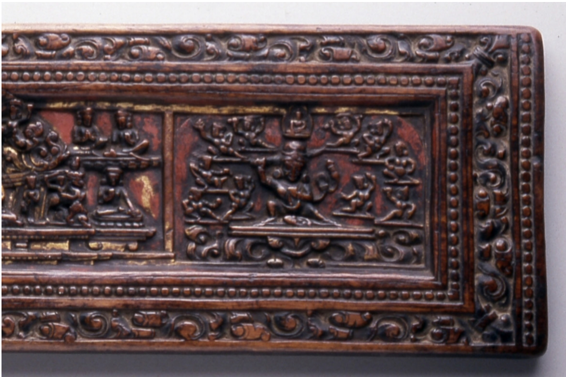
Fig. 7: Acala and the ten furies according to the vision of the Golden Isles guru. Wooden MS cover (detail), Tibet, c. 13th century, The Walters Museum accession no. W.896. < https://art.thewalters.org/detail/7630/cover-of-a-buddhist-manuscript/ >

The depictions of figures resembling the Golden Isles Acala produced in South and South-east Asia are of particular interest. Stone sculptures of standing, sword-bearing figures have been discovered in Kedah itself. One defaced sculpture, usually identified just as a gate-guardian ( arca dwarapala ), features striations that apparently represent the flames of Buddhist krodha iconography. This sculpture is usually displayed in the Lembah Bujang museum. Several gate-guardian figures of precolonial Java, Bali and Sumatra could be regarded as depictions of Acala, as well, although they have not yet been identified as such (e.g., Perret 2020: 40, fig. 11). A rare depiction of the standing Acala from South Asia is a 10th-century statuette recovered from Anuradhapura in Sri Lanka. The statuette was sponsored, according to its Tamil-script dedication, by the Nānādeśīya merchant guild (Fig. 8) (see von Schroeder 1990: 298–99, plate 84E). This statue may be linked through its seafaring Tamil merchant sponsors to nearby Nagapattinam, a site that was well within the Golden Isles Dharmakīrti's sphere of influence. Insofar as any of these images can be identified as Acalas, they show that the deity worshipped by the Golden Isles Dharmakīrti may well have had a presence in the Golden Isles themselves.