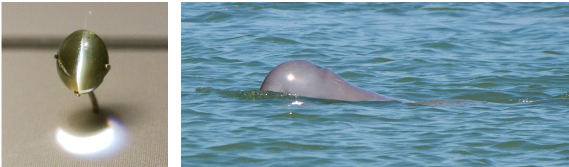
Fig. 6: Cabochon cut cat's-eye chrysoberyl from Sri Lanka (left), Irawaddy Dolphin (right).

Which of the west-facing ports of Śrīvijaya correspond to Atiśa's sailing directions? Let us start with Sumatra, where the Golden Isles guru is routinely assumed to have resided. The secondary literature on Tibetan Buddhism, with only a couple of recent exceptions, has not explained the entrenched assumption that Atiśa's landfall lay in Sumatra. Insofar as this assumption rests on the common understanding that Sumatra is part of Suvarṇadvīpa, it must be said that the Malay Archipelago is part of Suvarṇadvīpa as well. There is no scope here for a fresh study of the classical toponymy of the region, but let it be added that the island of Sumatra, with a coastline of over 4800 kilometres in length, is hardly a more specific destination for seafarers than 'the Golden Isles'.