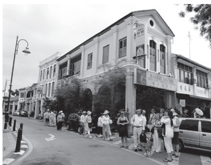
Cultural tourism at Armenian Street

Conservation is a challenge in a city that is under-regulated and hungry for private investment. At least now, the state leadership accepts that the city's 'Outstanding Universal Values' have to be protected. The first OUV is the city's built heritage or townscape consisting of several thousand double-storey shop-houses, studded with an East India Company fort, religious monuments, townhouses and bungalows, public buildings and mercantile offices. A special area plan for the two sites was drawn up in fulfilment of UNESCO requirements, but the semi-government George Town World Heritage Incorporated has lasting difficulty in employing architectural heritage expertise at local salaries to carry out monitoring and advisory functions. Furthermore, lax urban management has resulted in the proliferation of illegal swift-breeding, a threat that has depopulated entire historic towns across Southeast Asia.