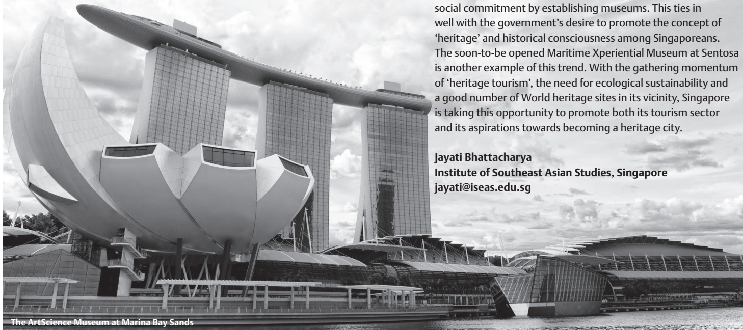
The ArtScience Museum at Marina Bay Sands