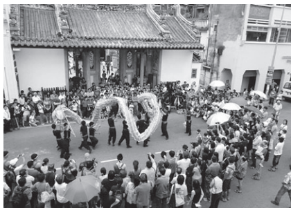
Dragon dance in front of the Teochew Temple