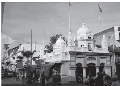
Nagore Sufi-shrine dating from 1801

George Town, the capital of Penang, Malaysia, is now a World Heritage Site. How it was built and the way it should be conserved or developed are issues constantly contested as part of a discussion on the extent to which it is possible to acknowledge the contributions of diverse peoples, mostly migrants. The 'Historic Cities of the Straits of Malacca', comprising the former British Straits Settlements ports of George Town and Melaka, were jointly listed by UNESCO in July 2008. Melaka dates from 1400 and has seen Portuguese, Dutch and British rule, whereas George Town, Penang, dates from 1786 and flourished in the era of British expansionism. Both cities illustrate the co-evolution of Asian family business and the shop-house form in Southeast Asia. The attainment of world heritage status for George Town was partly due to long-term, bottom-up lobbying by the Penang Heritage Trust and the arts education group Arts-Ed, as well as private conservation efforts. The listing is now celebrated with a month-long George Town Festival in July.