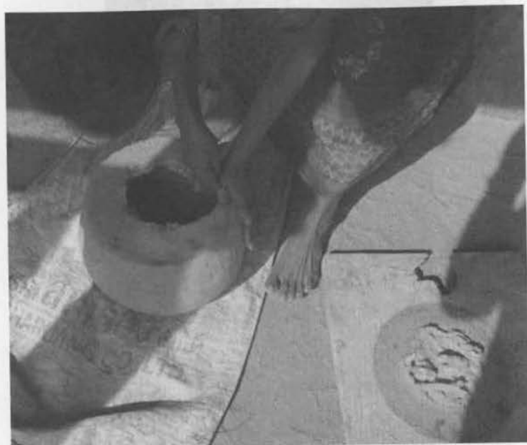
Figure 5. Baan Chuomphouy potter completing pot base using clay left on board