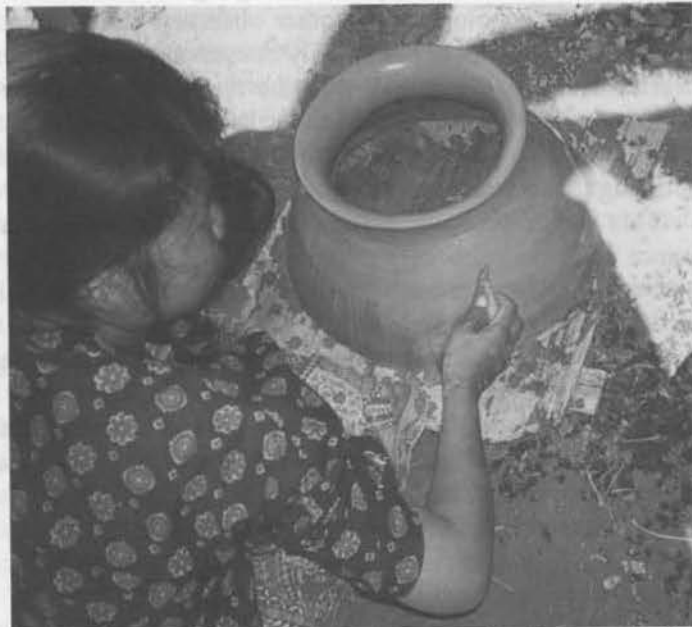
Figure 2. Baan Na Kradao potter completing "preform", upper half of form