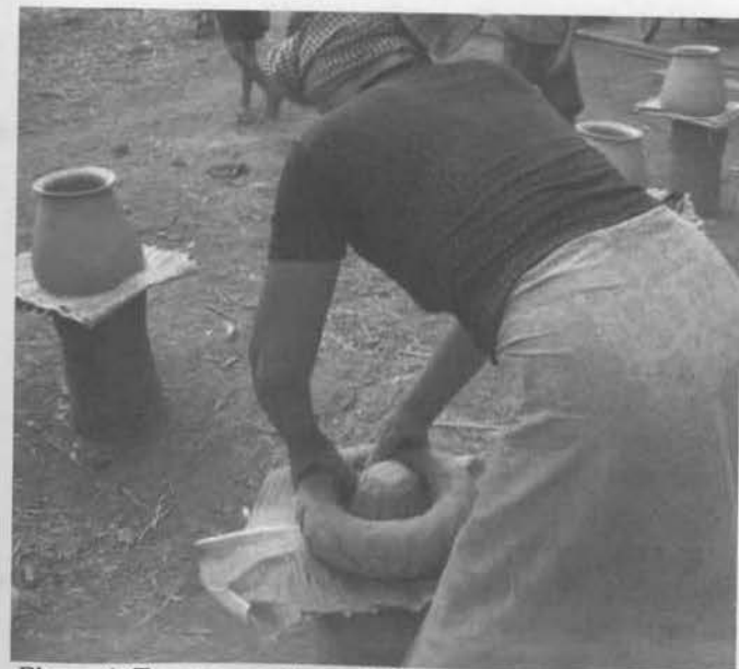
Figure 4. Tampuan potter wedging out walls from clay lump