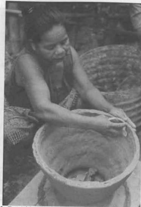
Figure 3. Baan Na Kradao potter scraping inverted preform