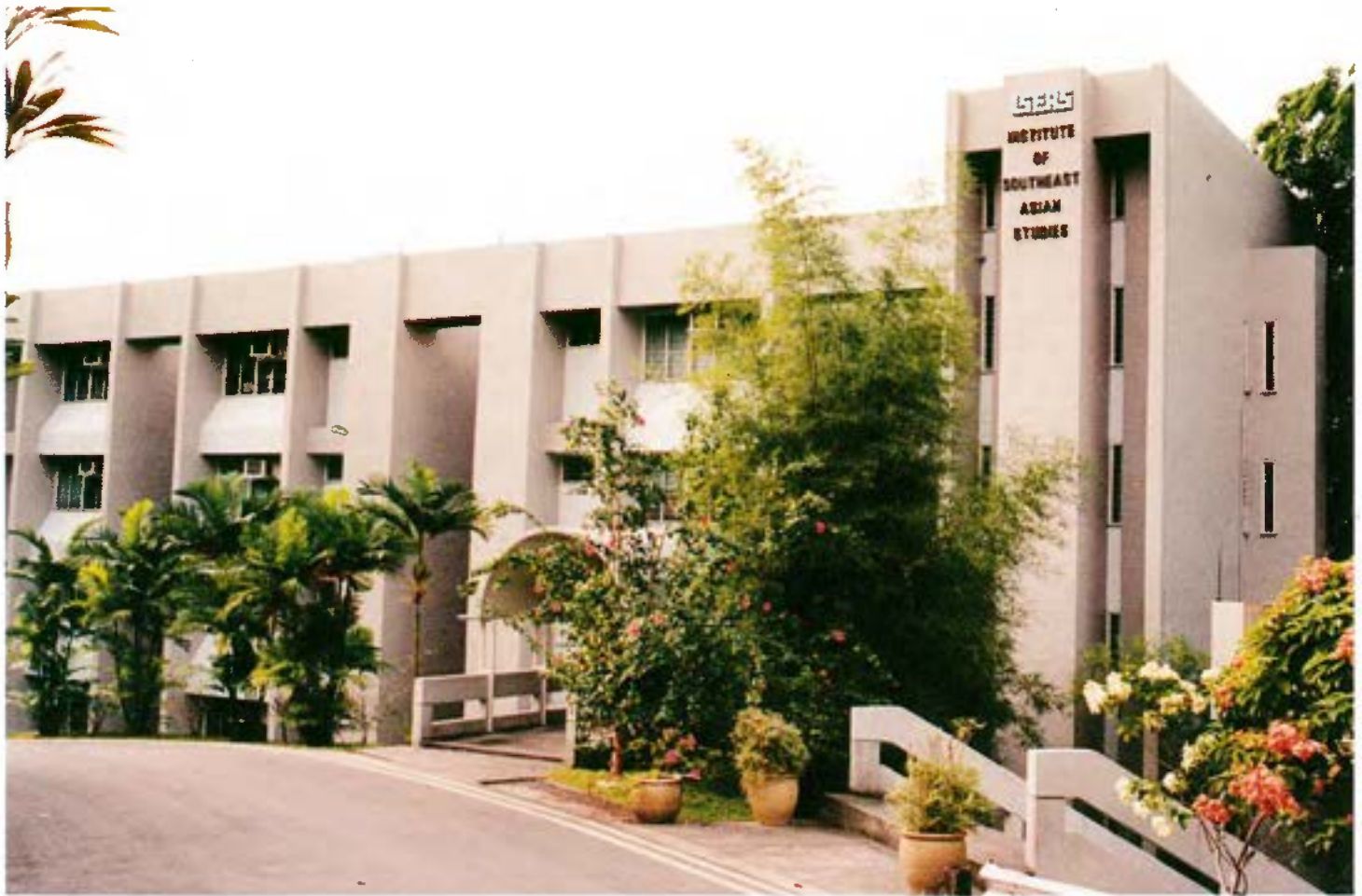
The Institute of Southeast Asian Studies, Heng Mui Keng Terrace, Singapore 0511.