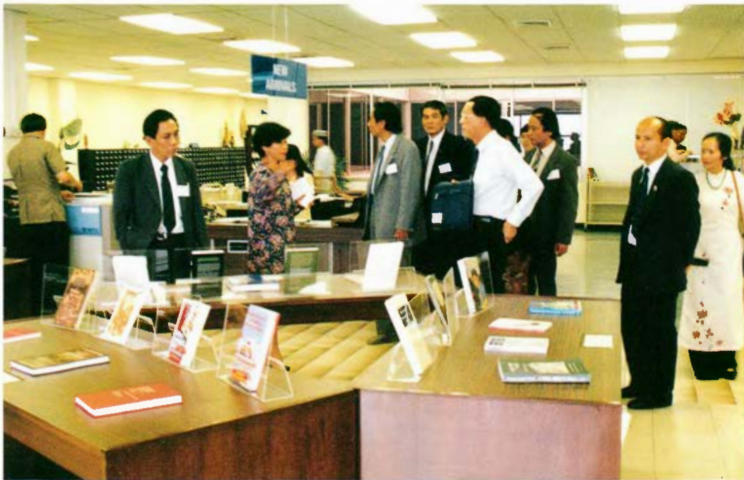
Participants of the Workshop on Developmental Issues in Vietnam, Laos, Cambodia, and Myanmar, visiting the ISEAS Library on 22 March 1991.