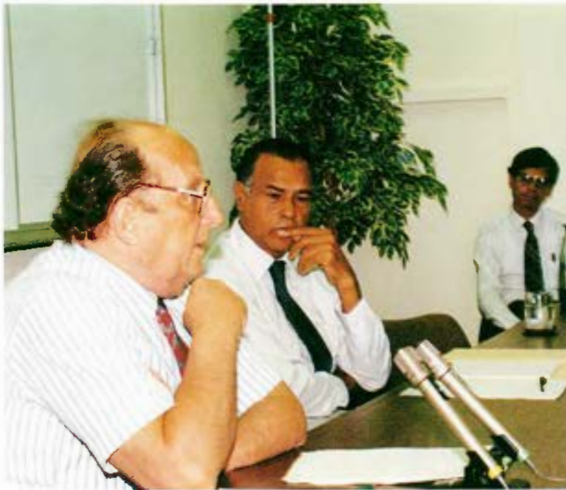
Dr Georgi Arbatov (above), Director, USA-Canada Institute, Academy of Sciences of the USSR, giving a seminar on "Domestic Political and Economic Situation in the USSR and Its Impact on Soviet Foreign Policy", on 9 March 1991.