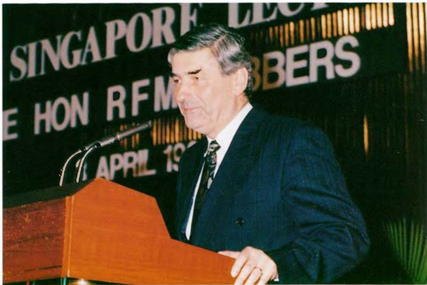
The Honourable Mr R.F.M. Lubbers delivering the eleventh Singapore Lecture on 3 April 1991.