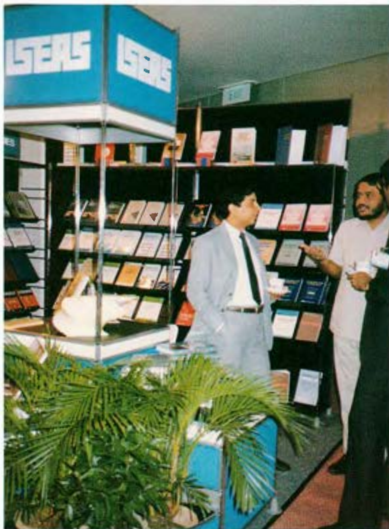
Publications of ISEAS were promoted at the Asia-Pacific Petroleum Conference (APPEC) held on 17-19 September 1990 in Singapore as well as at the Eleventh Ikapi Book Fair (Book Fair of the Indonesian Publishers Association) held in Jakarta on 22-31 July 1990 (below), which was visited by H.E. Lt-Gen. (Ret.) Sudharmono, Vice-President of Indonesia (centre).