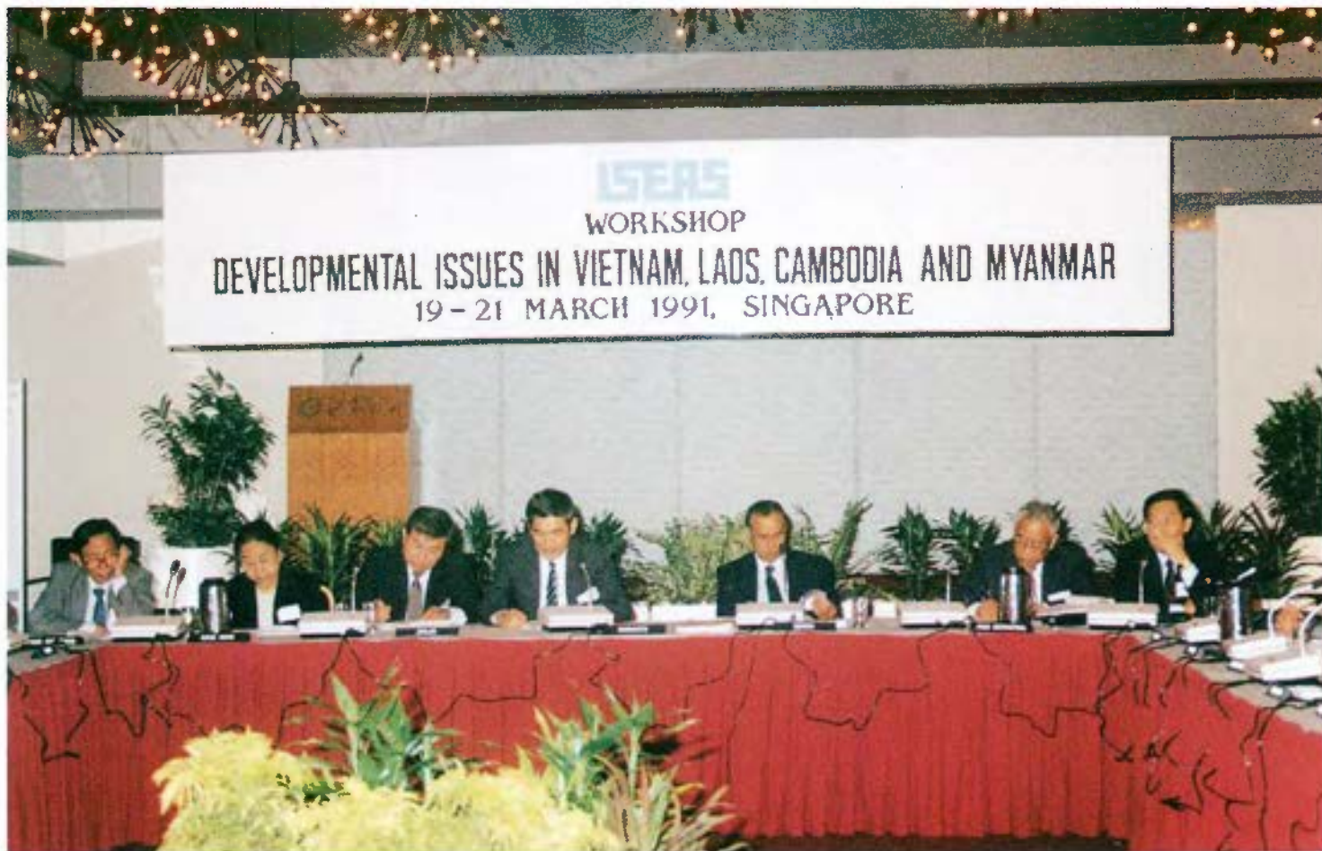
The Workshop on Developmental Issues in Vietnam, Laos, Cambodia, and Myanmar brought together senior officials and academics from the four countries as well as Singapore and the other ASEAN countries.