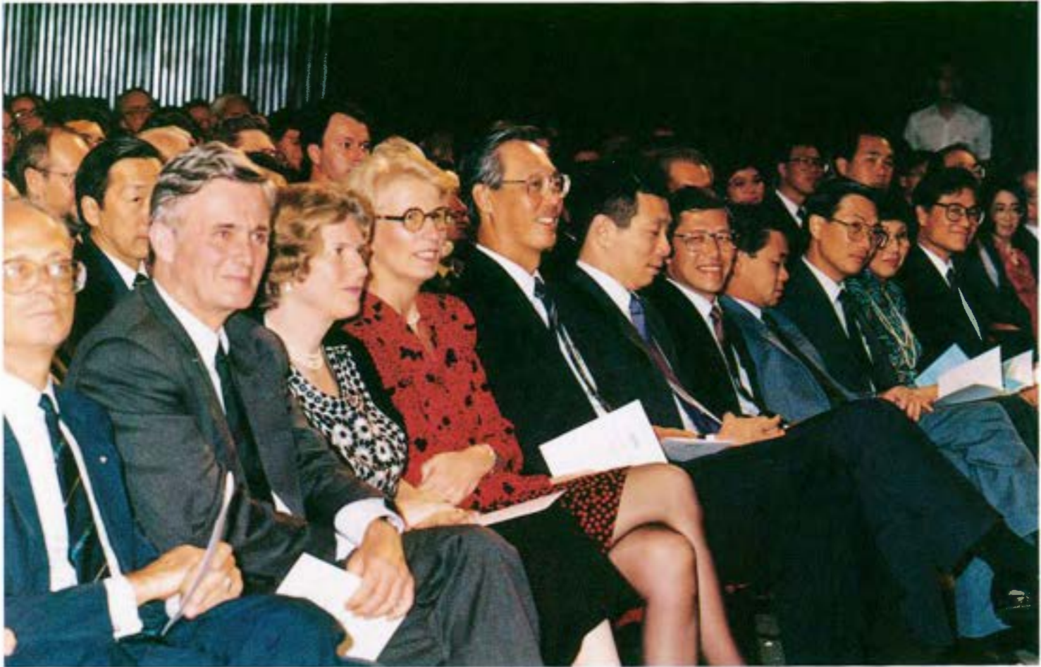
The Singapore Lecture was attended by a capacity audience, including the Prime Minister of Singapore, Mr Goh Chok Tong, and the Deputy Prime Minister and Minister for Trade and Industry, Brigadier-General Lee Hsien Loong.