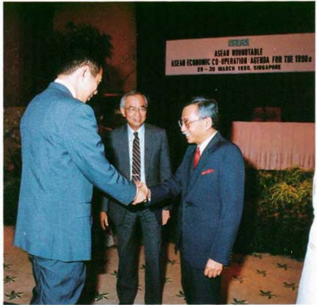
Minister Daim being greeted by Brigadier-General Lee Hsien Loong, Minister for Trade and Industry and Second Minister for Defence (Services). Looking on is Dr Richard Hu, Minister for Finance, Singapore.