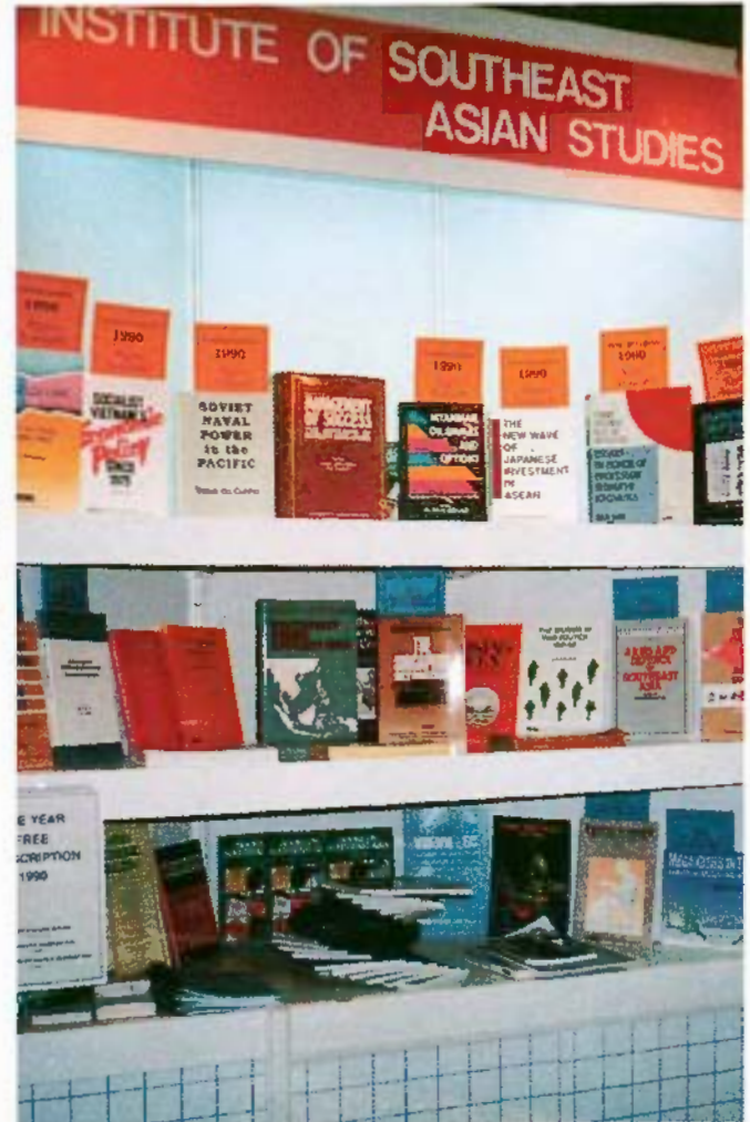
Publications of ISEAS were promoted at the 1st Tokyo International Book Fair held from 27 February to 1 March 1990.