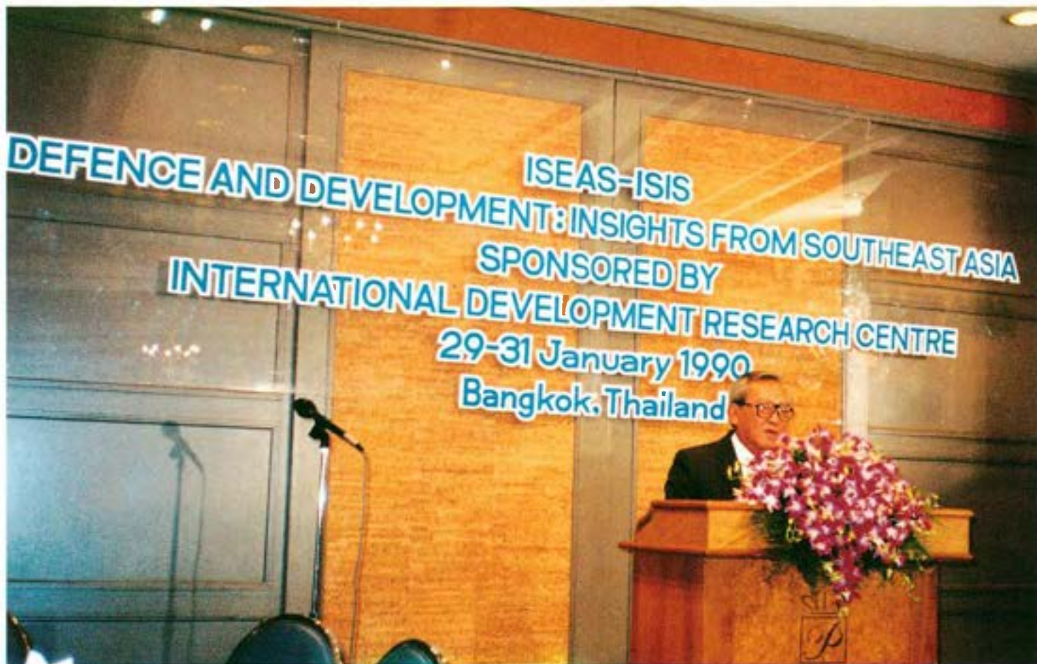
His Excellency General Chatichai Choonhavan, Prime Minister of Thailand, delivering the Opening Address at the joint ISEAS-ISIS International Conference on "Defence and Development: Insights from Southeast Asia" held in Bangkok from 29 to 31 January 1990.