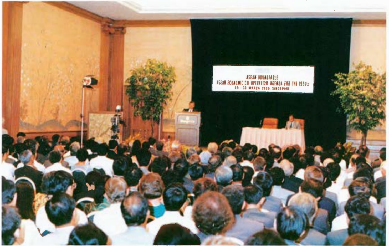
Y.B. Dato' Paduka Daim Zainuddin, Minister for Finance, Malaysia, giving his Opening Address on the occasion of the Institute's Fourth ASEAN Roundtable on "ASEAN Economic Co-operation: Agenda for the 1990s".