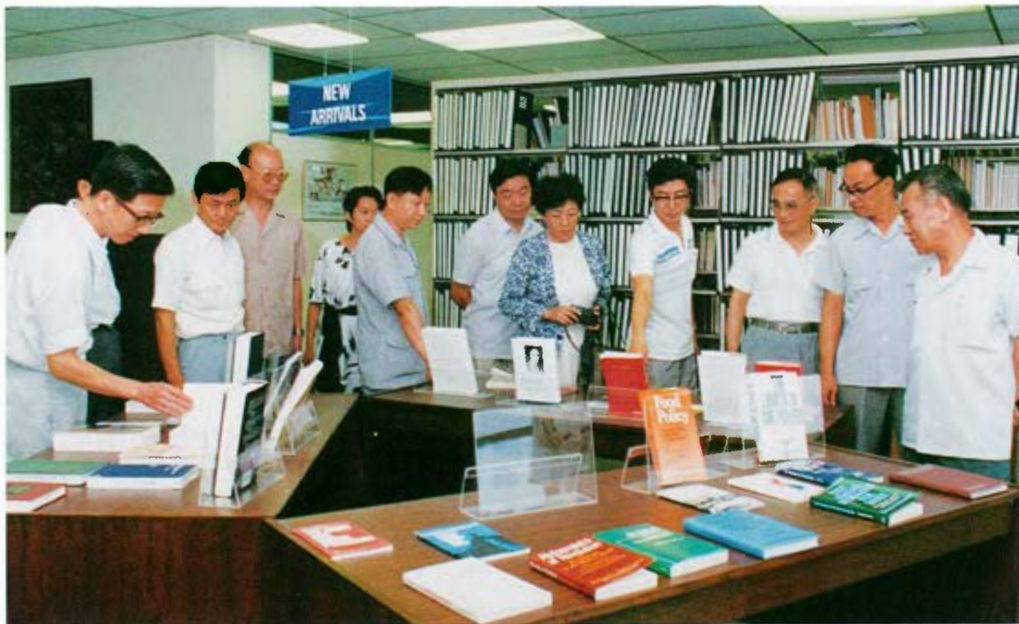
Members of the research team from the Institute of World Economics and Politics (IWEP) and Chinese Academy of Social Sciences (CASS), People's Republic of China, visited the ISEAS Library when they were in Singapore to attend the Joint ISEAS-IWEP Workshop on ASEAN-China Economic Relations in the Context of Pacific Economic Development and Co-operation on 14–18 August 1989.