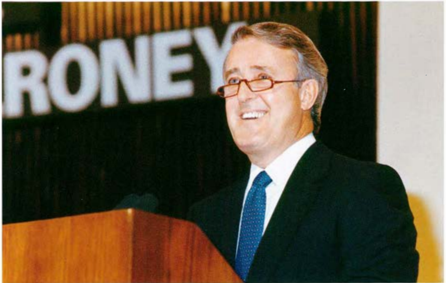
The Right Honourable Brian Mulroney, Prime Minister of Canada, delivering the 1989 Singapore Lecture on "Trade Outlook: Globalization or Regionalization".