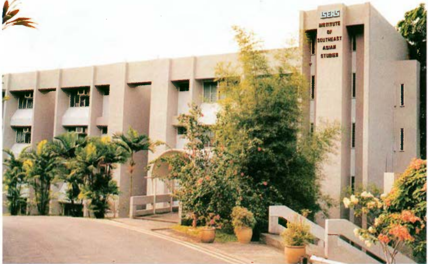
The Institute of Southeast Asian Studies at Heng Mui Keng Terrace, Singapore 0511.