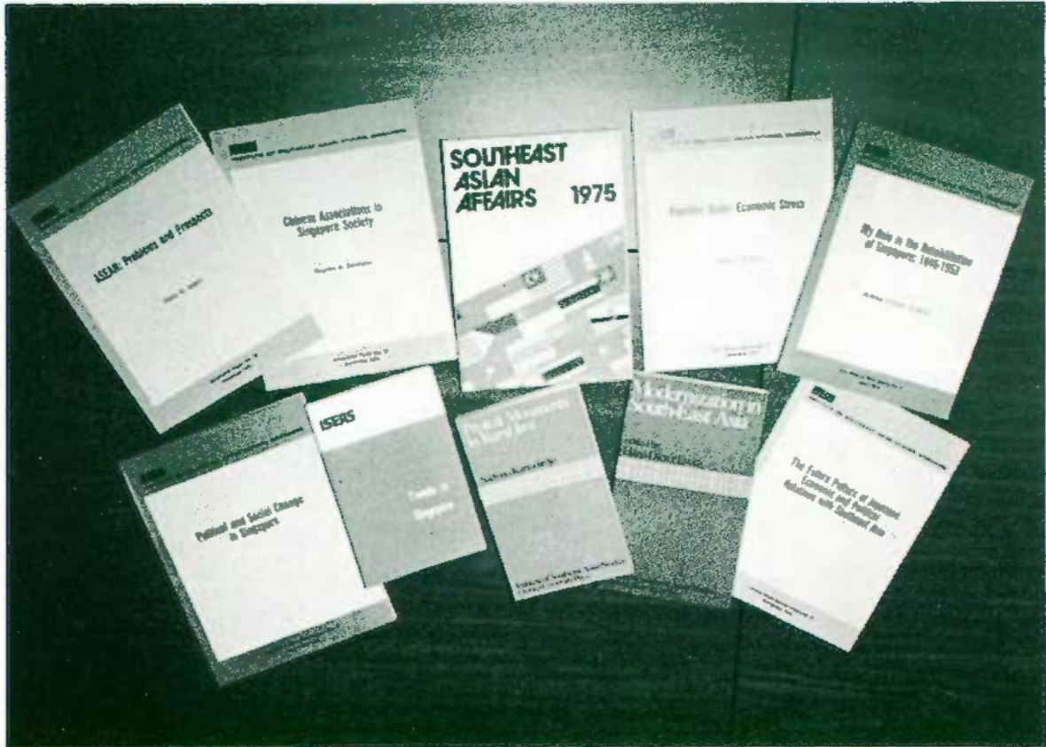
Some publications of the Institute.