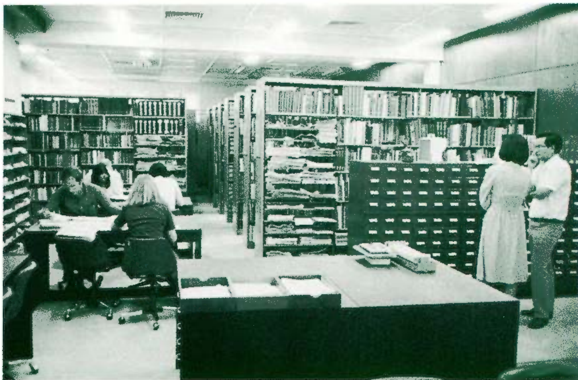
The new ISEAS Library.