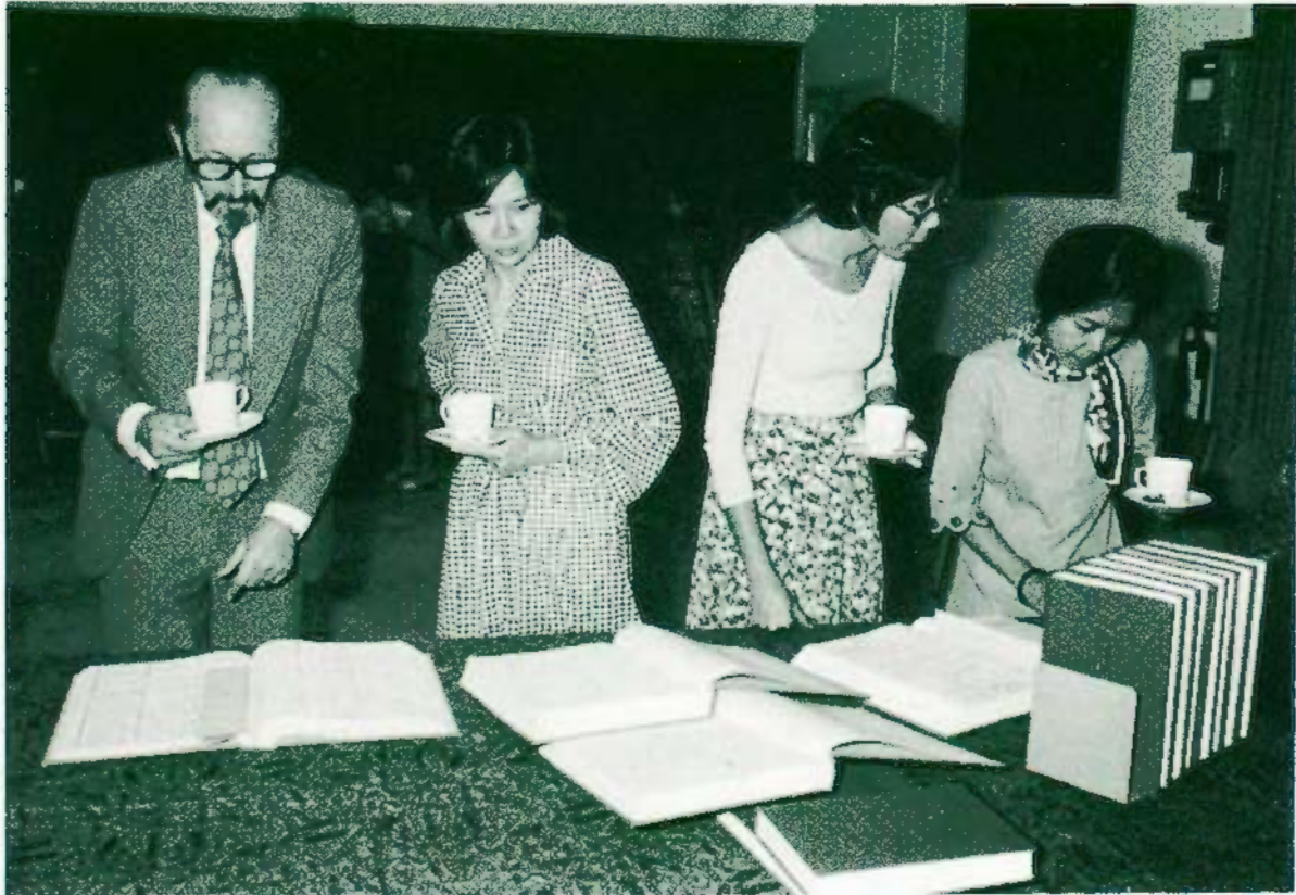
Readers examining the Library's set of an encyclopaedia of Marxism, Communism and Western Society.