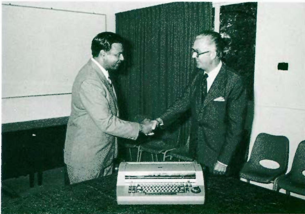
The Institute Director receiving a gift of an IBM Electric Composer from the German Ambassador in Singapore.