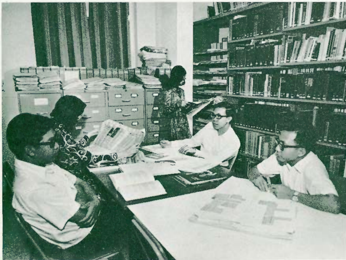
The Library Reading Room