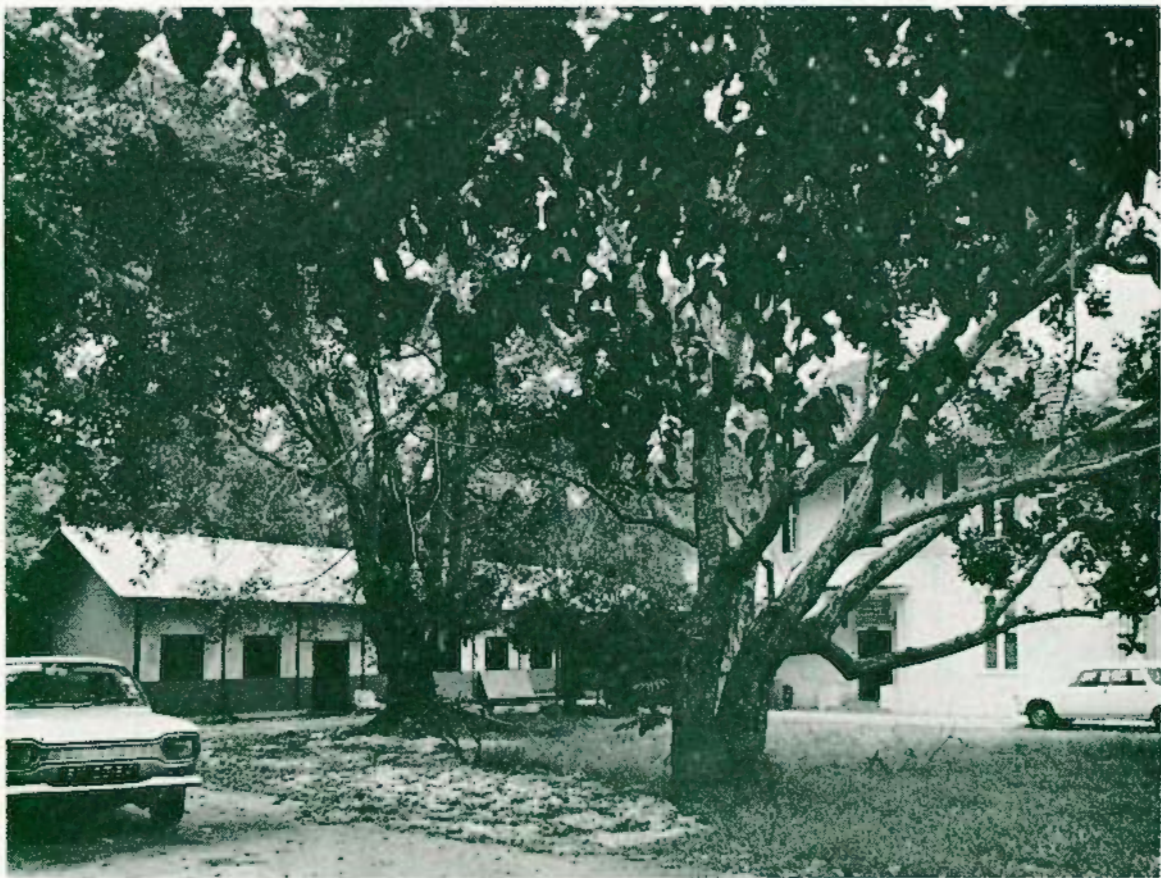
The Institute Building