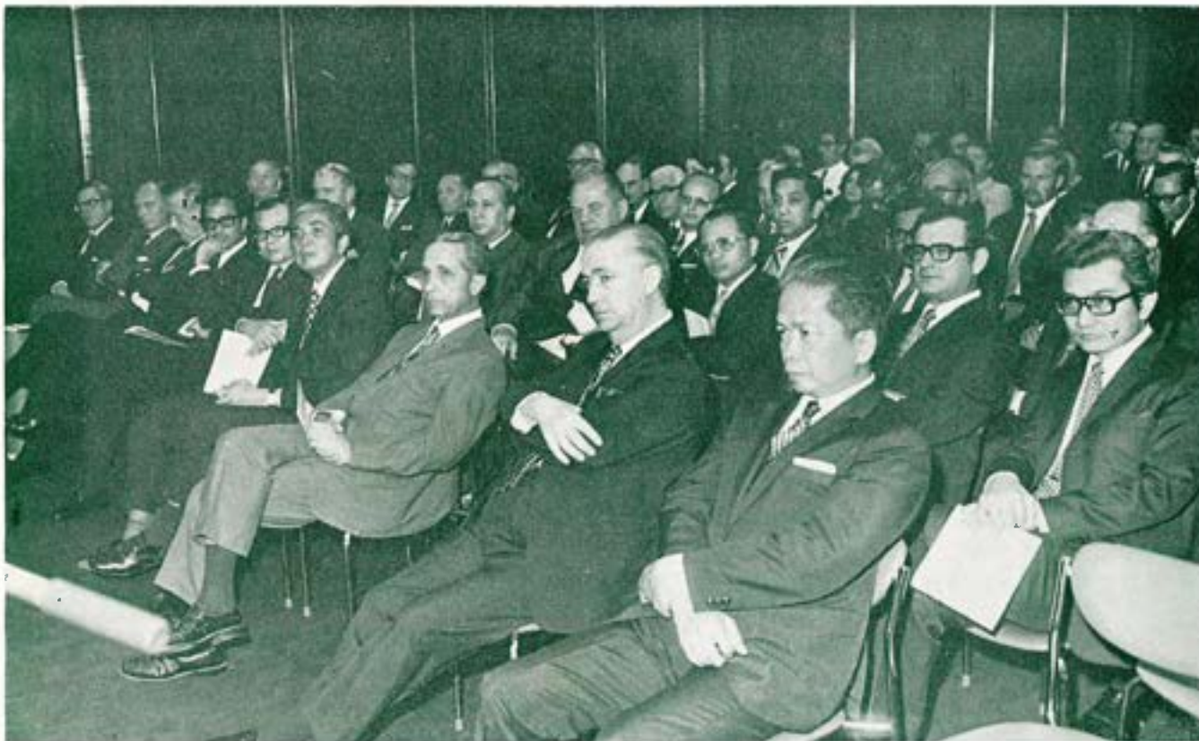
A section of the audience listening to the Minister.